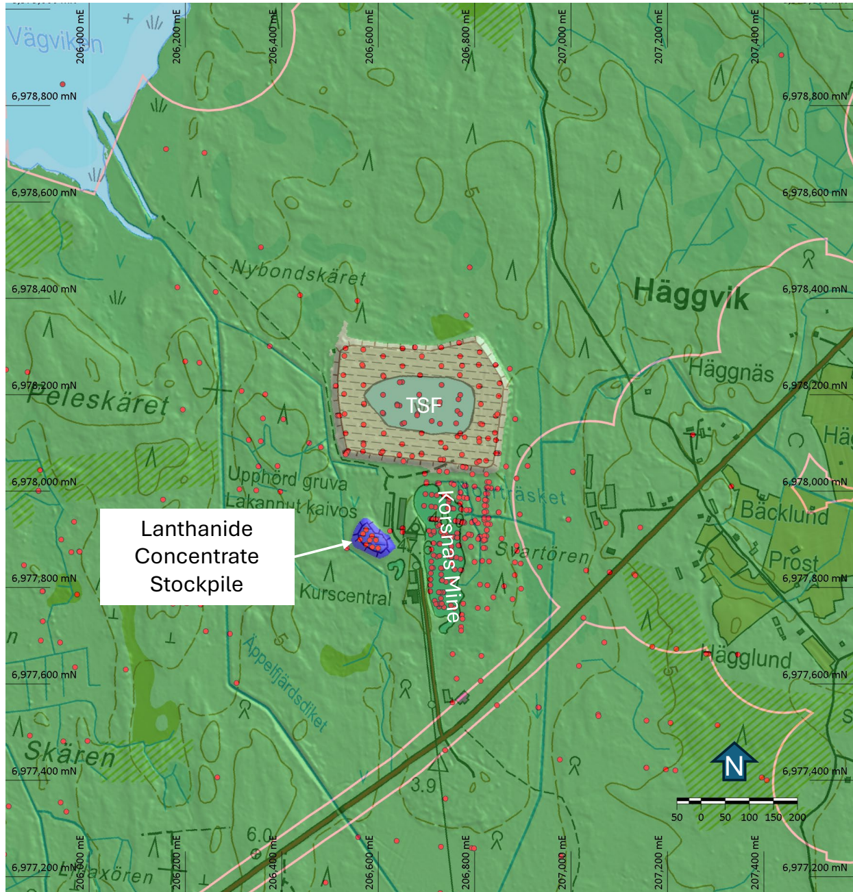
Map showing the location of the Korsnäs lead mine and the nearby lanthanide concentrate stockpile used as the source material for the current ANSTO metallurgical evaluation. The lanthanide concentrate was produced by Outokumpu during historical mining operations at Korsnäs between 1965 and 1972, when the company recognised the rare earth potential of the mineralised material. Most of the stockpiled concentrate remains on site and provides a readily available source of rare earth mineralisation for modern metallurgical testwork. Drill collars from historical and recent drilling, together with local cultural features, are also shown for reference. Coordinate grid shown is ETRS-TM35FIN / EPSG:3067, in metres.

In a continuation of the metallurgical test work program with ANSTO 4 , direct acid-bake/water-leach testing has achieved high extraction of the key magnet rare earths from untreated historical Korsnäs lanthanide concentrate.