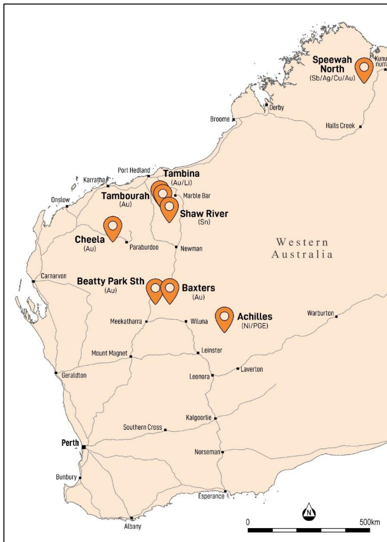
Figure 3: Tambourah Metals Project Locations