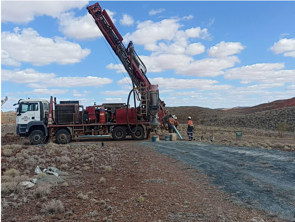
Figure 2 RC Drilling at Tambourah King.

Please see Tambourah's website www.tambourahmetals.com.au for further information.