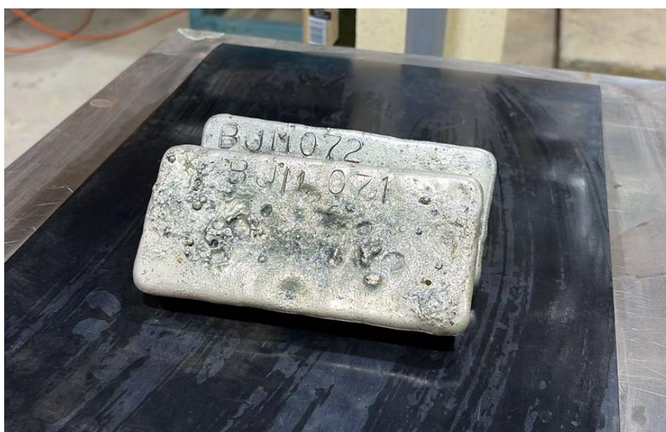
Figure 2: Doré bars BJM071 (107.1 oz) and BJM072 (63.0 oz) produced during the gold pour completed on 28 June 2026.