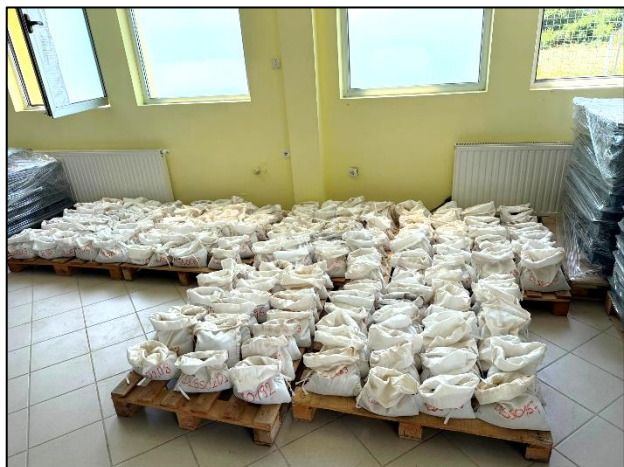
Figure 2: Samples drying prior to dispatch to laboratory