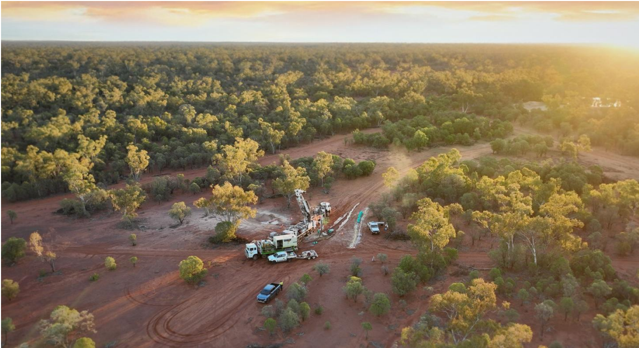
Figure 1 - Drilling Commenced at the Byrock Project, NSW; UDR1000 drill rig pictured - Resolution Drilling (NSW)