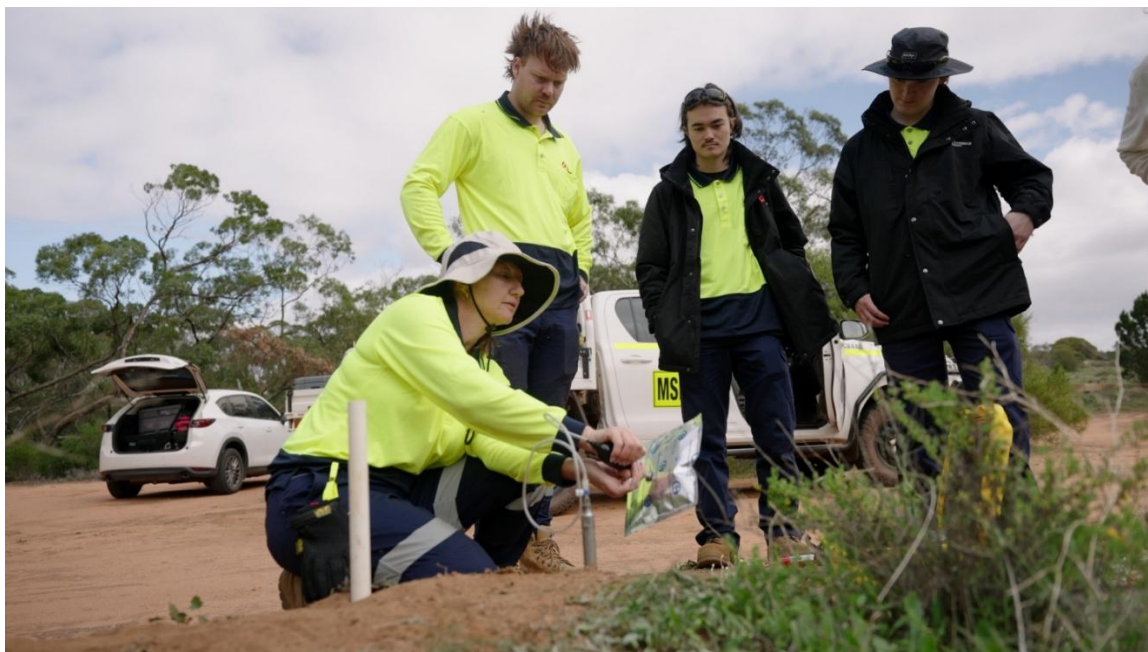
Figure 1: Prominence Energy team collecting gas sample during PEL 803 Soil Gas Survey, April 2026.

The results represent a significant technical milestone and provide a stronger foundation for advancing PEL 803 toward seismic acquisition and target definition.