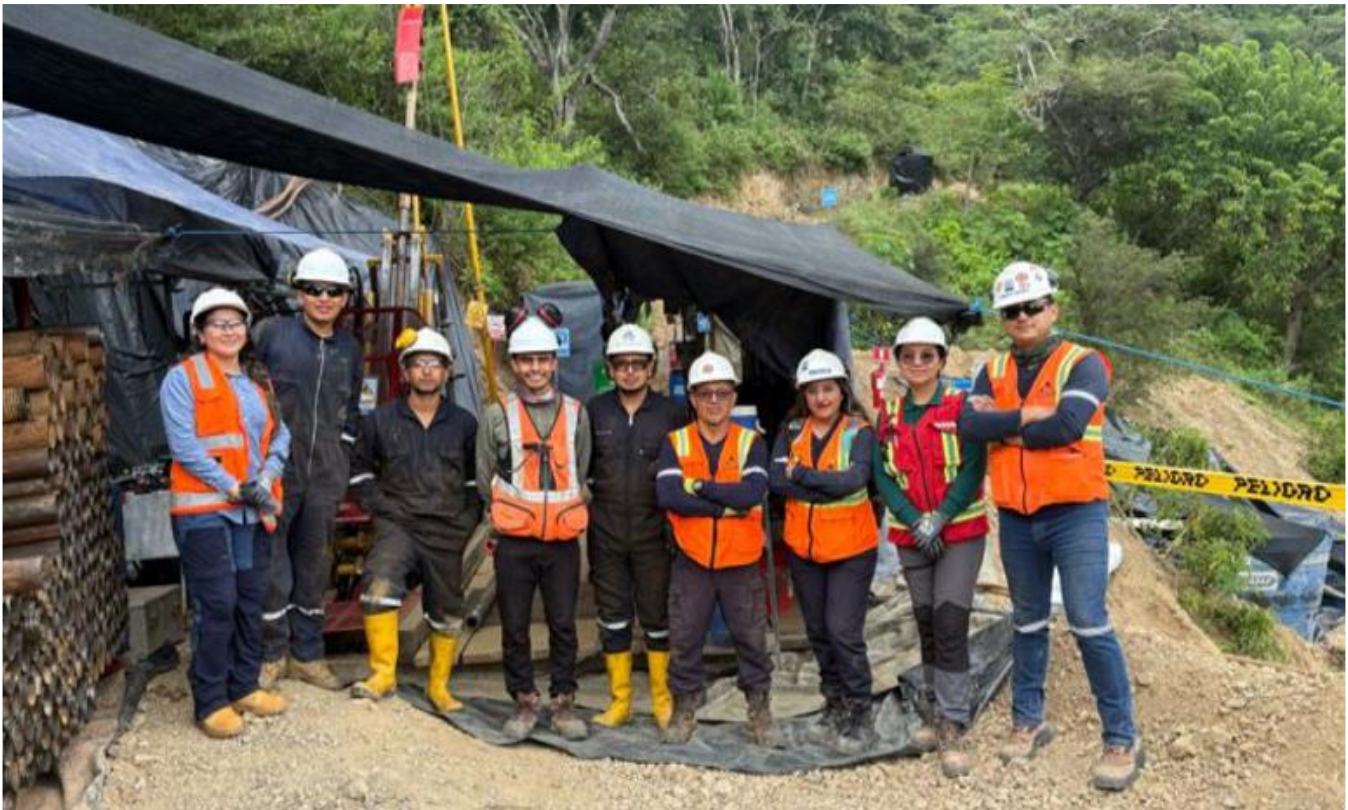
Plate 1. Titan exploration team and Kluane drilling contractors at the Dynasty Gold Project, May 2026.

Several of these drill intersections remain open and are set to be tested by Titan's 2026 resource extensional drilling program which is now underway. First results from the current drilling program are expected in the coming 4-6 weeks. The Company looks forward to announcing results as they are received.