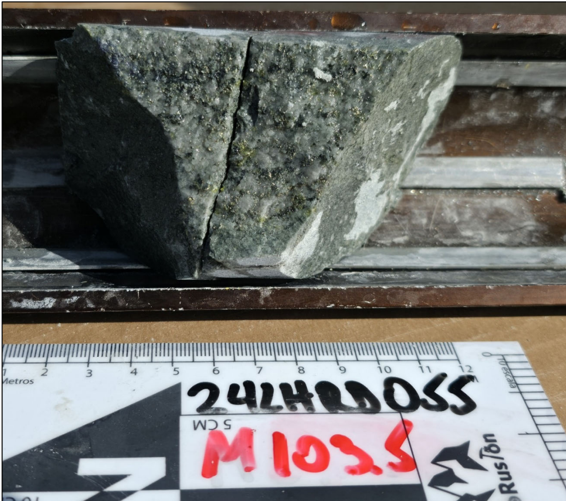
Figure 2: Typical disseminated chalcopyrite from 103.5m downhole in 24LHRD055* (refer to Appendix 1).

* Cautionary Statement: Visual estimates of mineral abundance should never be considered a proxy or substitute for laboratory analysis where concentrations or grades are the factor of principal economic interest. Visual estimates may also provide no information about impurities or deleterious physical properties relevant to valuations.