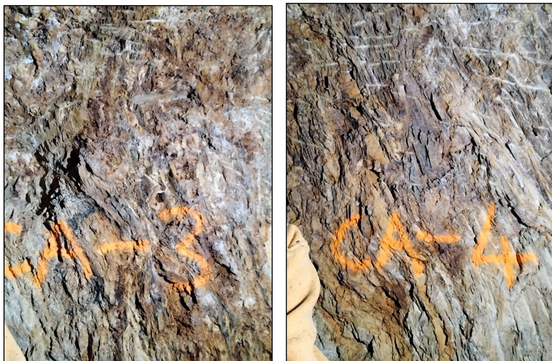
Figure 3: Adit Channel sampling (adit location 375992mE, 5333827mN MGA94 Zone 55).

The sampling program comprised 12 continuous one-metre channel samples, collected from the southern wall of the Adit (Figure 3). This Adit was discovered by the Company's technical team in its previous reconnaissance field work program, and to this point had been unrecorded (ASX:AUH announcement 30 September 2025).