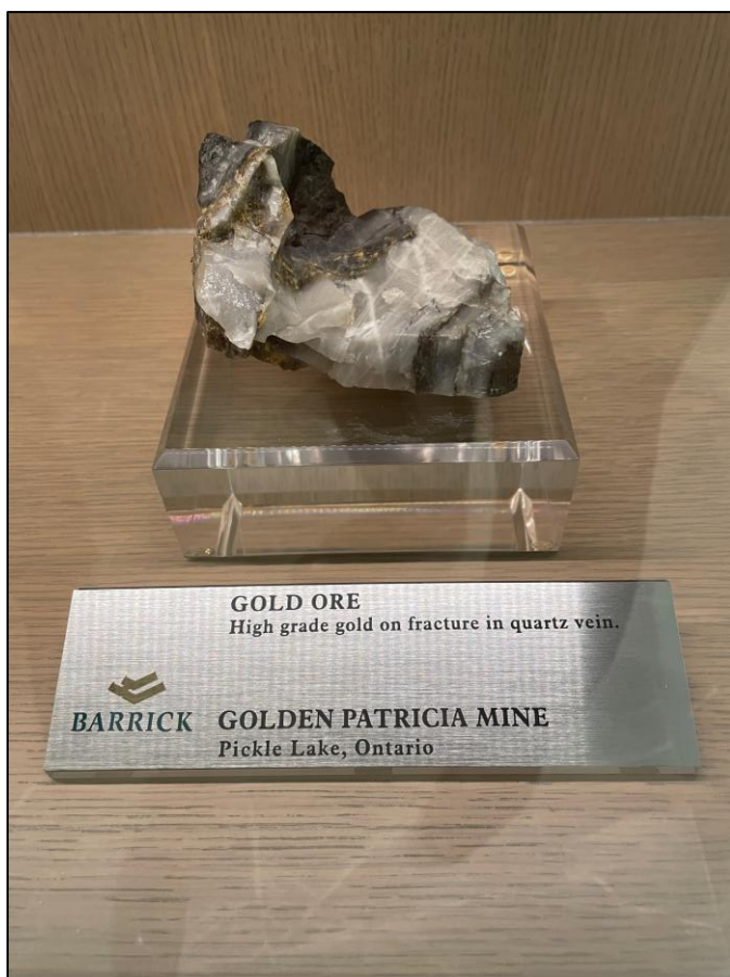
Figure 3 – Historical Golden Patricia specimen on display in Barrick’s corporate office, Toronto