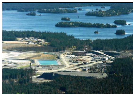
Figure 4 – Golden Patricia, active operations looking east, circa 1996