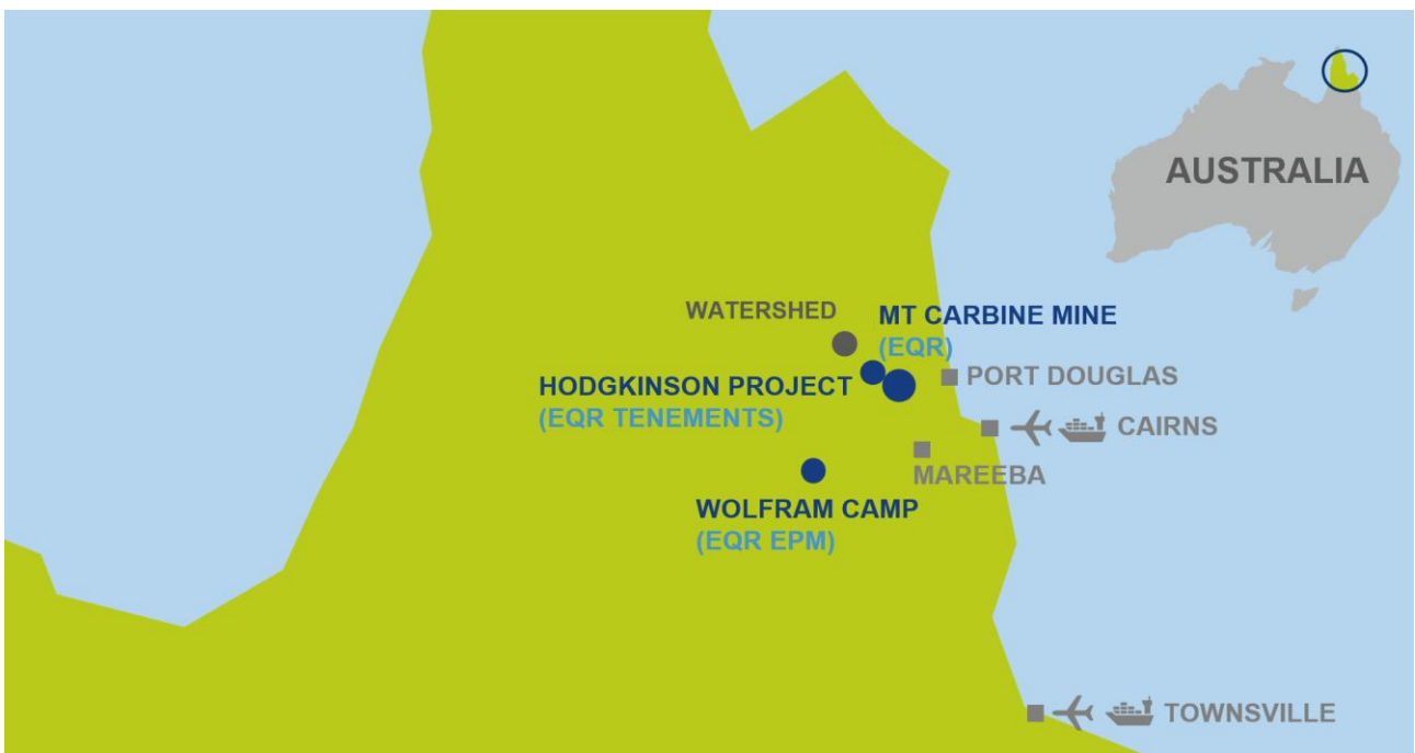
Figure 2: Hodgkinson Project Proximity to Mt Carbine