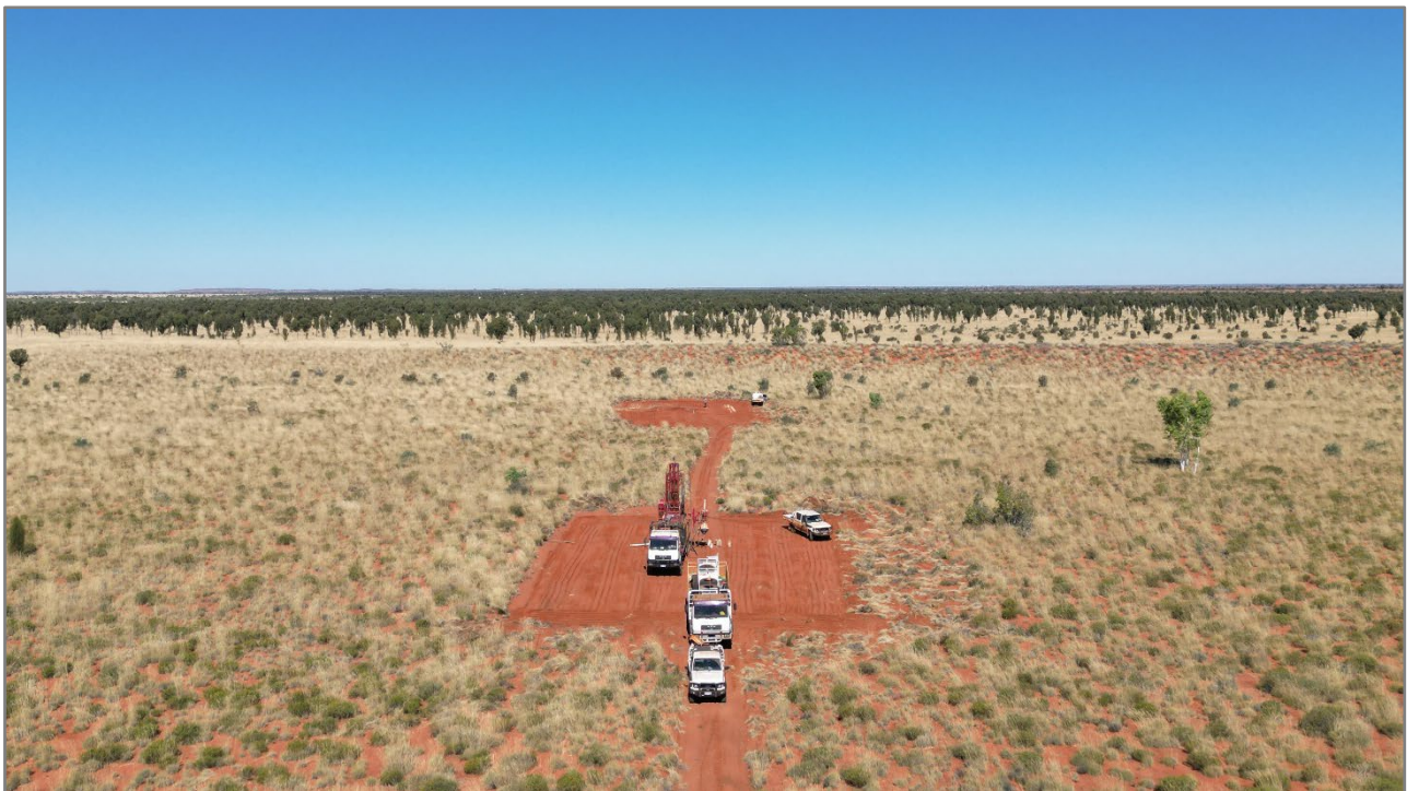
Figure 1. Aircore drilling at Lonar East, West Arunta Project

Tali Resources Ltd (ASX: TR2) ( Tali or the Company ) is pleased to advise that its aircore drill program has commenced at the West Arunta Project.