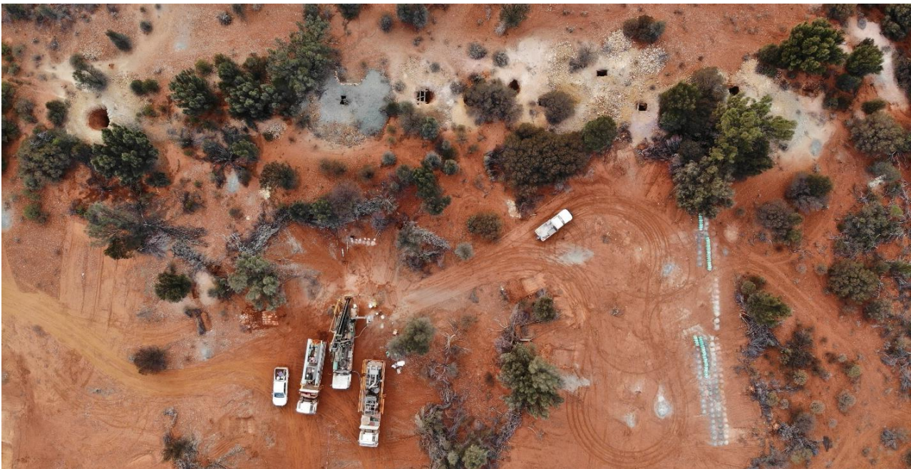
Figure 2: Drone image of drilling at Metzke's Find in 2020 showing part of the line of historical workings.

Metallurgical testwork from Metzke's Find has confirmed that mineralisation is free-milling (non-refractory) coarse gold and amenable to conventional extraction methods including a strong gravity recovery (averaging 78.5%) with combined gravity and CIL recoveries averaging 98.9%.