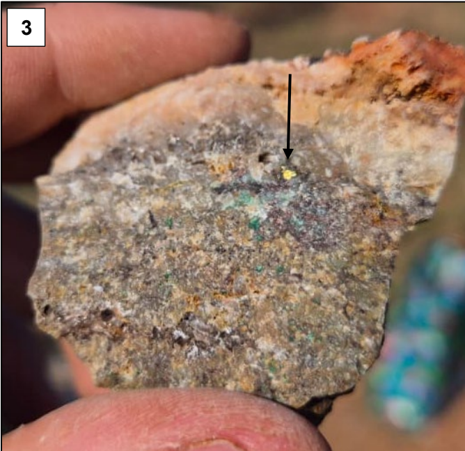
Figure 2: Rock chip samples:

(1) Sample F3705 – Malachite staining throughout quartz host reported 1.03% Cu and 0.17% Pb.