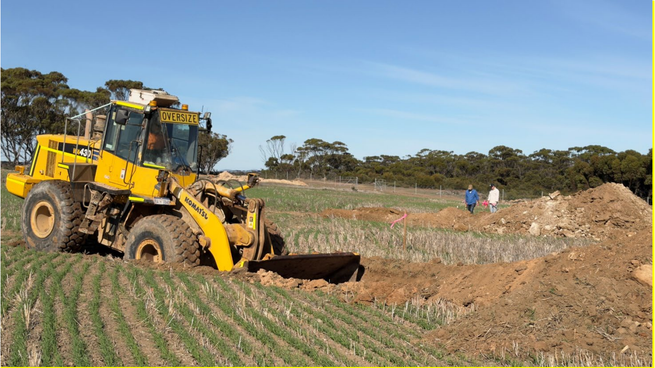
Figure 1: Site works underway at Maori Queen.

The approved program has been designed to systematically test four prospects across the Mt Cattlin Gold Project: Sirdar, Maori Queen, Ellendale and Plantagenet. The program targets shallow extensions to the high-grade Sirdar and Maori Queen deposits — both of which carry exceptional historical grades — and provides the first modern systematic RC drill-testing of the Ellendale and Plantagenet prospects.