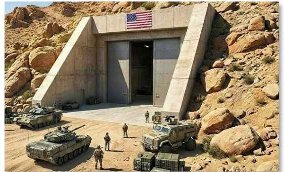
Image of concrete bunker, which could potentially employ EdenCrete for its blast resistant properties

Penetration figures: GBU-57A/B MOP, single-bomb best-case estimate. Source: Dolzikova & Bronk, RUSI Commentary, March 2025; as reported by The Economist (June 2025)