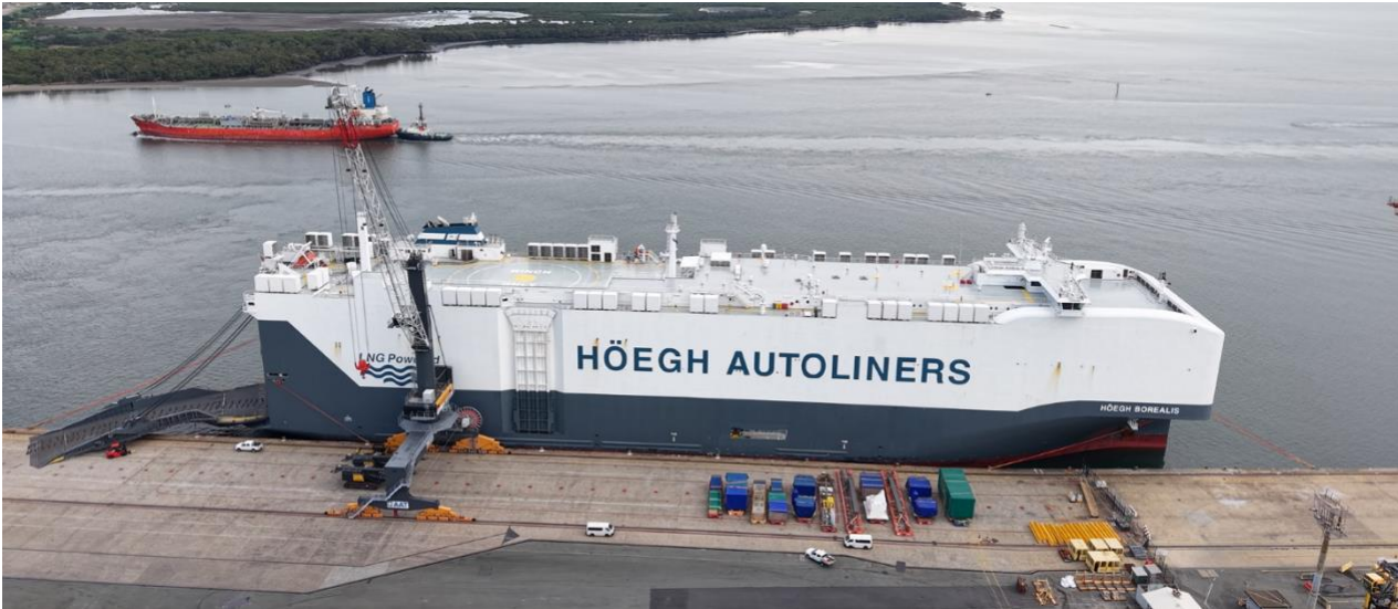
Images: Unloading of GE Vernova turbines and associated equipment at Brisbane Port

This announcement has been authorised for release by the Board.