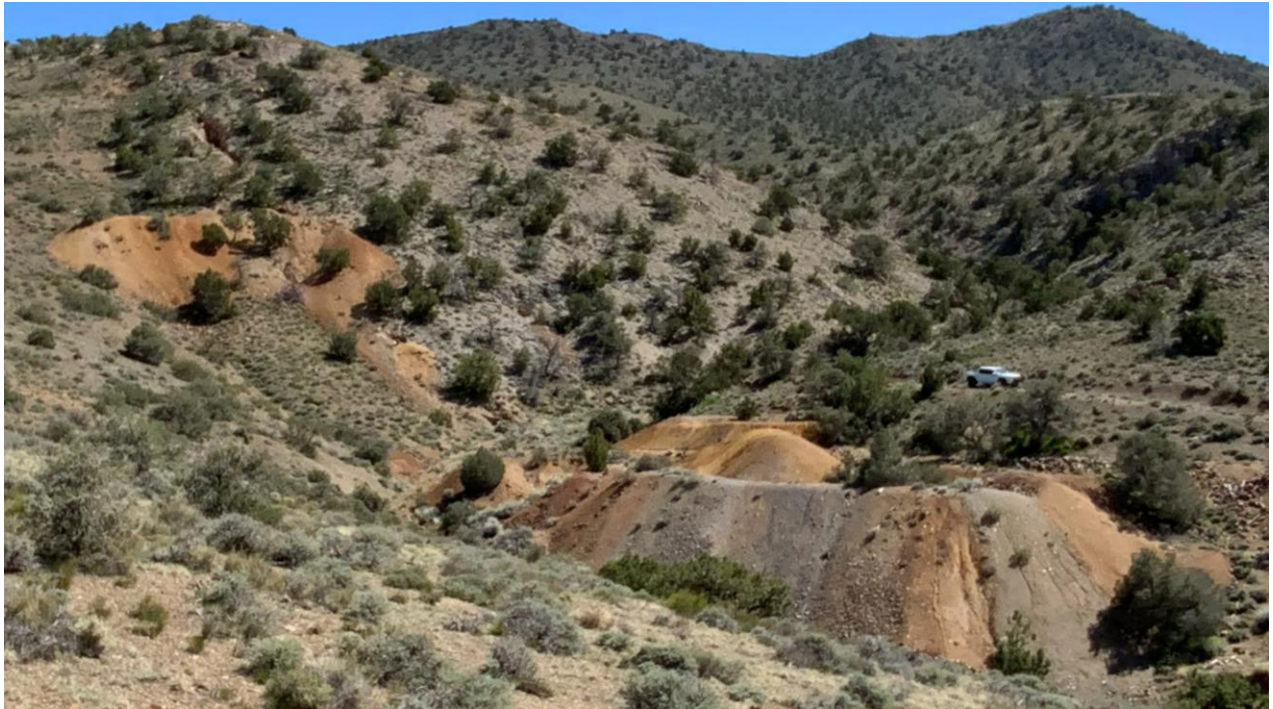
Figure 2: Excelsior Springs landscape highlighting extensive Blue Dick Workings