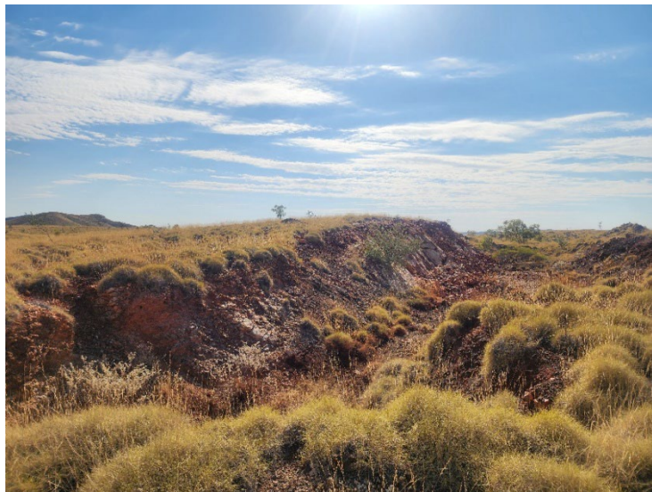
Figure 1: Historic workings on fluorite-bearing veins at Meentheena

The environmental studies will contribute to the preparation of access and management documentation associated with the Company’s proposed exploration activities, including the Reserve Access Management Plan (RAMP) previously outlined by the Company.