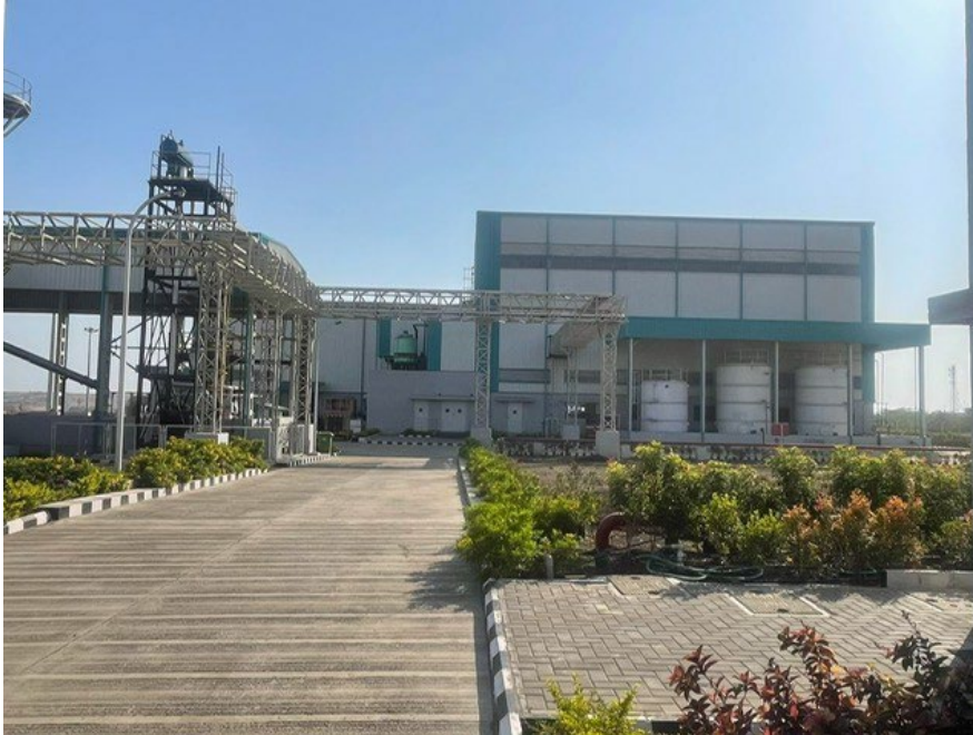
Expandable Graphite JV facility near Pune, India

Panthera Graphite Technologies is a 50:50 joint venture (JV) established with Metachem Manufacturing Co, an experienced expandable graphite producer near the city of Pune in India with over 20 years' operating history. Panthera's production facility is located in a Special Economic Zone, adjacent to key transport infrastructure. Operations commenced Q4 2024, with the first shipment made in March 2025.