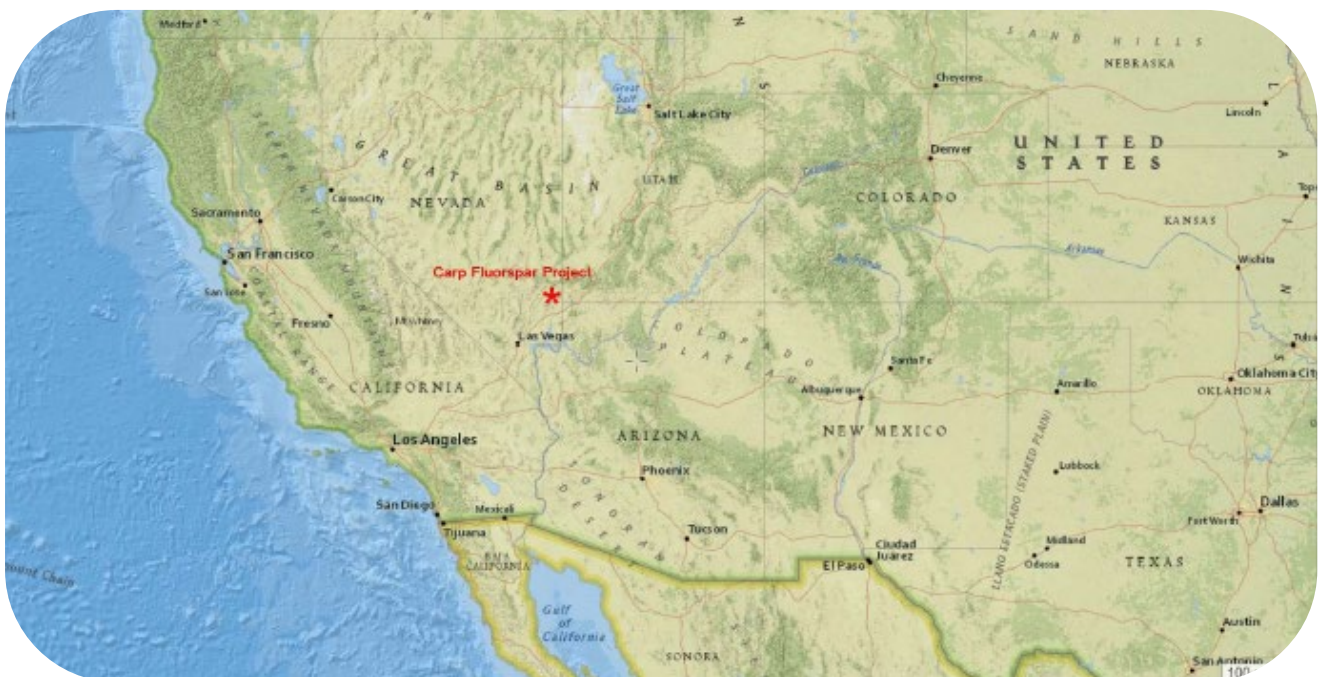
Fig. 1 Location map of the Carp Fluorspar Project