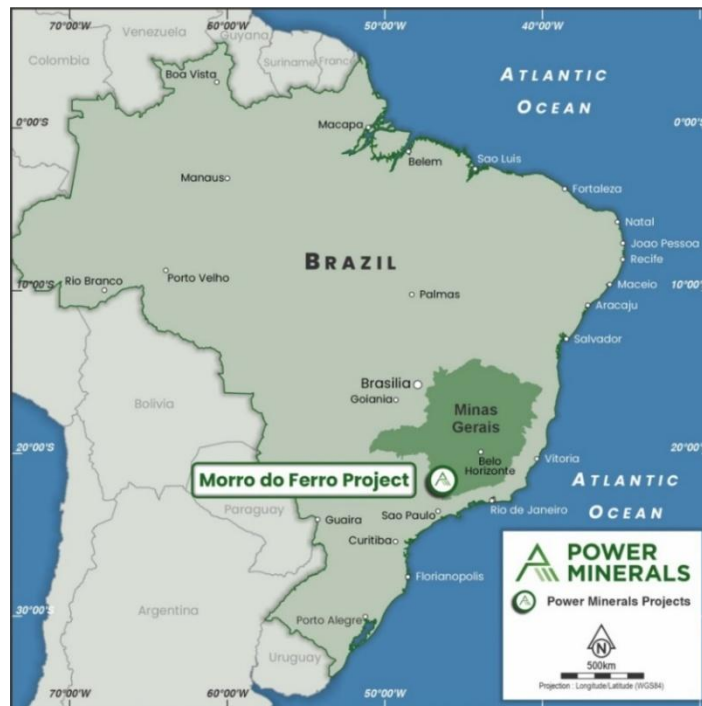
Figure 2: MDF Project location map in Minas Gerais State