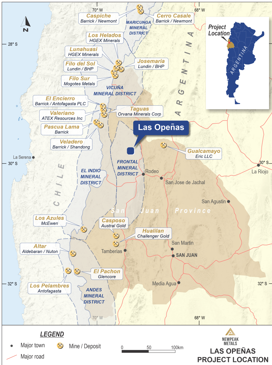
Figure 2: Location of Las Opeñas Gold Project