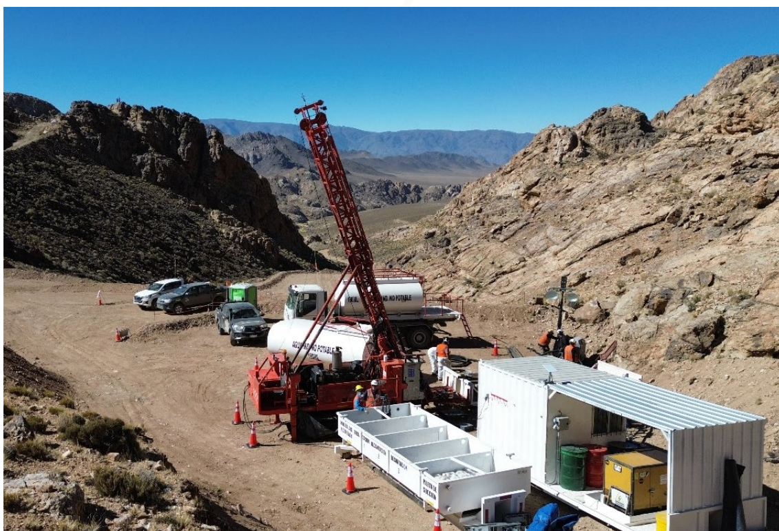
Figure 1: Rig setting up over first drillhole LODH-023

Drilling is planned to comprise of a minimum 2,500 metres across approximately 9 diamond drill holes with optionality to expand total drill metres. The program is designed to test extension of historic drill results, with the first hole testing an area near to a hole drilled in 2012, 12-LODH-03, which intercepted 115m @ 0.58g/t Au, 3.5g/t Ag, 0.24% Pb, 0.65% Zn from 18m to end of hole 1 .