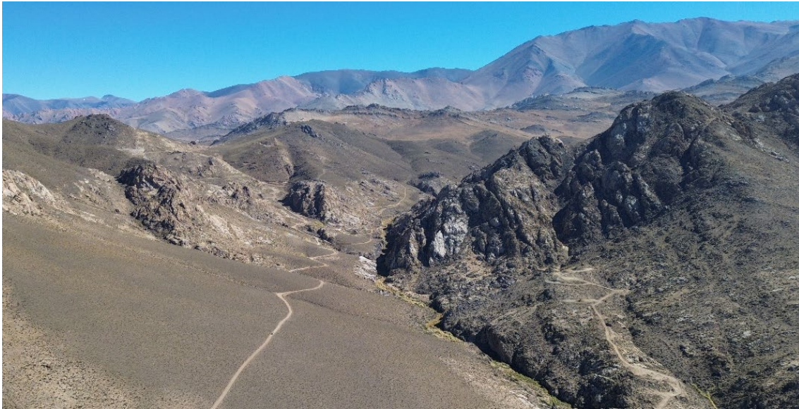
Figure 5: Project looking from east to west. Presagio is the large granite outcrop on the right-hand side; Belleza Breccia area is at the top left of the image.