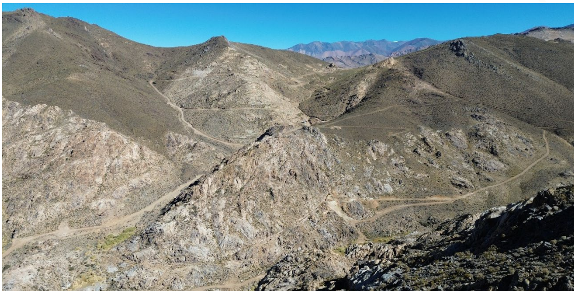
Figure 6: Belleza Breccia area looking southwest. After zooming in, drill and white vehicles parked in front of the drill are visible in the middle of image.