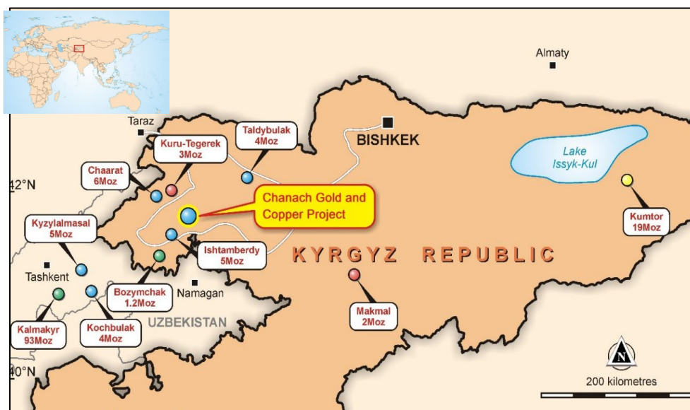
Figure 2: Chanach Project Location

To date the limited exploration activities have defined an Inferred Mineral Resource of 2.95 Mt @ 5.11 g/t Au for 484,000 ounces of Au and 17.23 Mt @ 0.37% Cu for 64,000t of Cu.