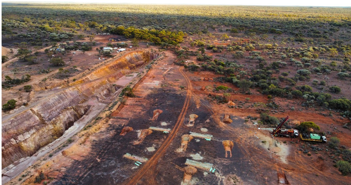
Picture 1: RC drill rig on site at Zelica targeting depth extensions of known mineralisation below pre-existing shallow open pit on the left (looking NNW)

The Phase 2 program targets both depth extensions below the existing vertical limit of previous drilling, and along-strike extensions of the ~1km defined mineralised zone. 17 RC holes were completed for 2,209m and initial assays results expected Q2 2026.