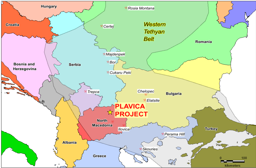
Figure 1 (above) Location of the Plavica Gold-Copper-Silver Project, North Macedonia