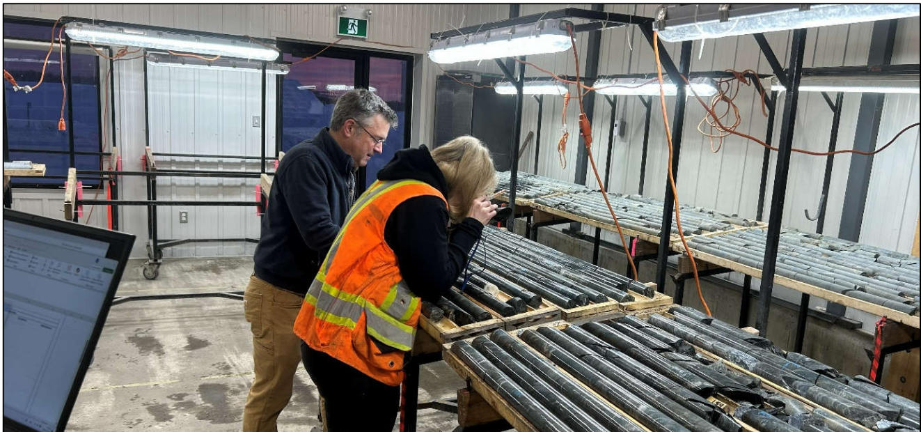
Figure 2 – Core from the Astoria project area being examined and logged by the Explo-Logik team

The project extends across a ~6km mineralised corridor, with multiple deposits and targets aligned along a continuous structural trend. The current Mineral Resource represents a portion of this broader system, with drilling aimed at testing extensions and additional zones.