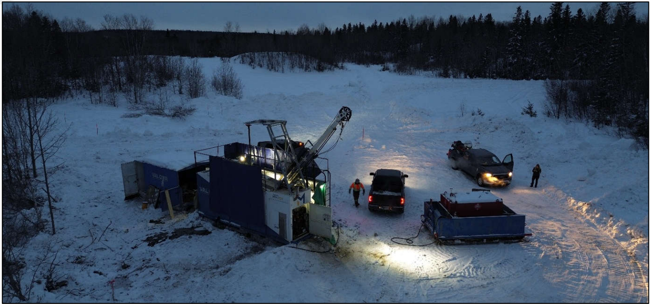
Figure 1 – Drilling at the Astoria project area of the Rouyn Gold Project, Québec, 2026.