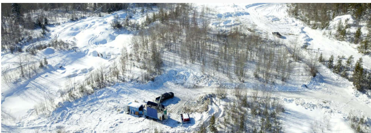
Figure 3 – Drilling at the Astoria area, Rouyn Gold Project, Québec.

These workstreams support early-stage evaluation of development pathways.