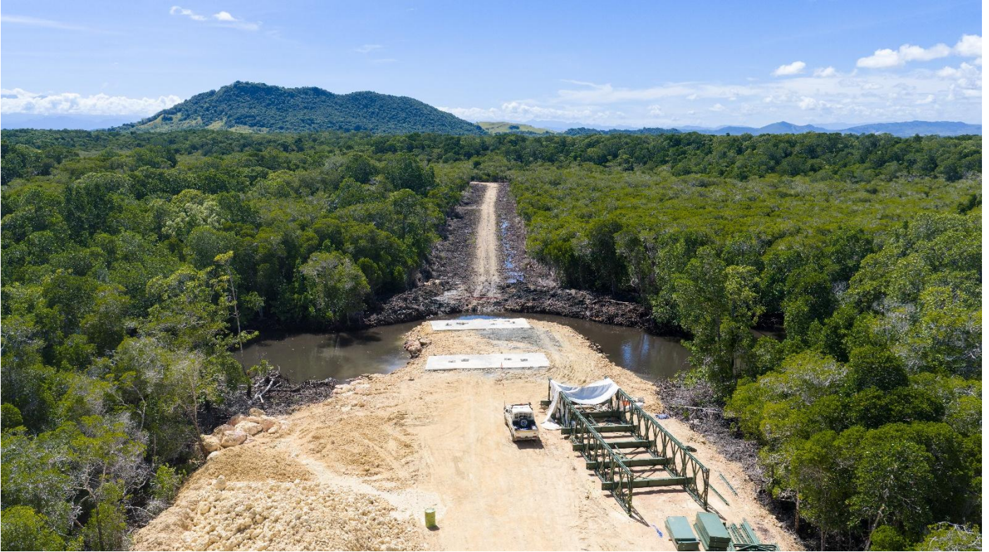
Image 3: Bridge 1 piling was completed with works progressing into abutment construction.