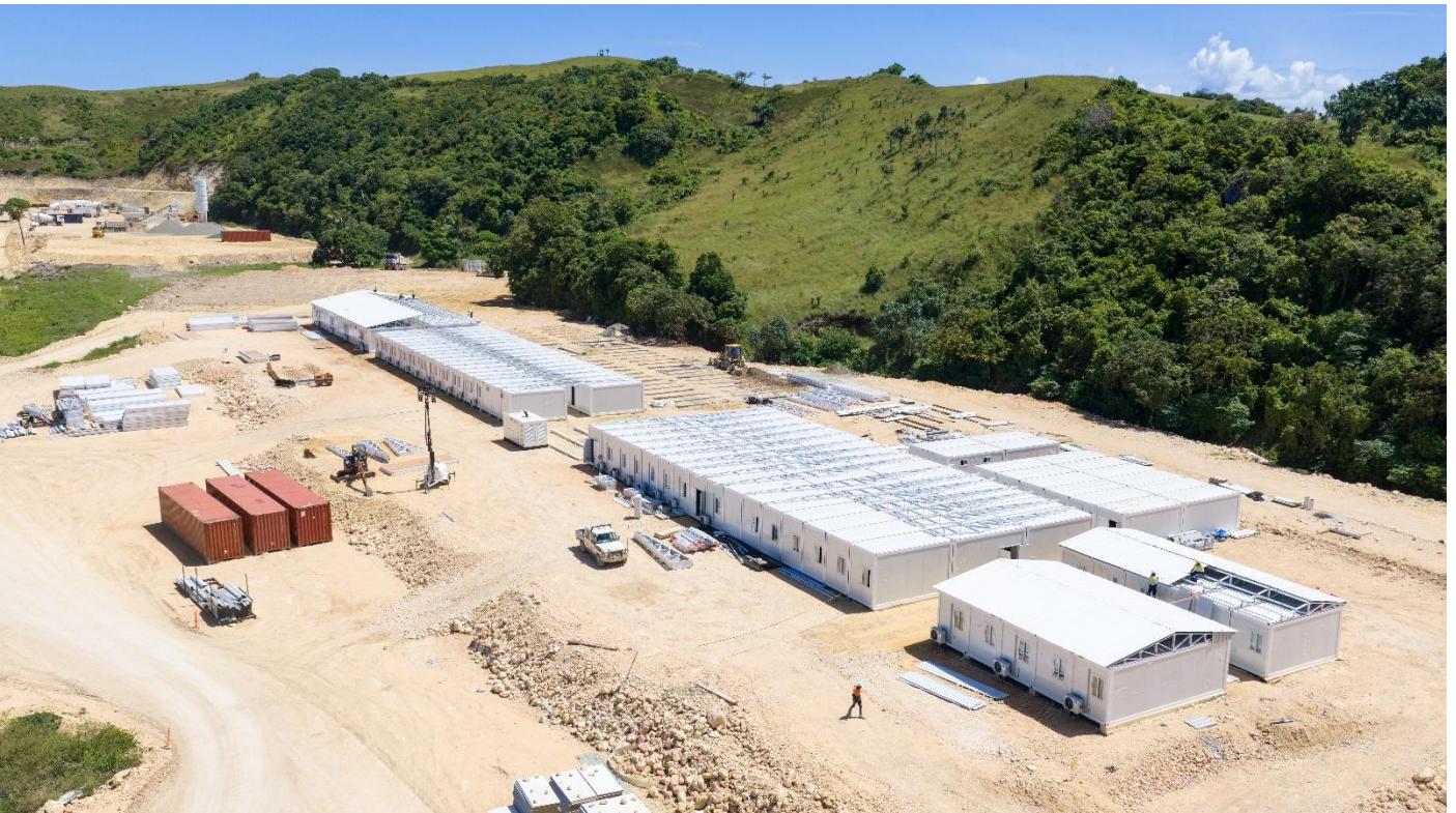
Image 6: Camp infrastructure is now positioned to support the transition into structural phase operations.