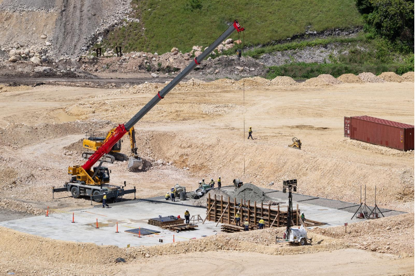
Image 5: All Terrain crane was fully assembled and commissioned, supporting installation works.