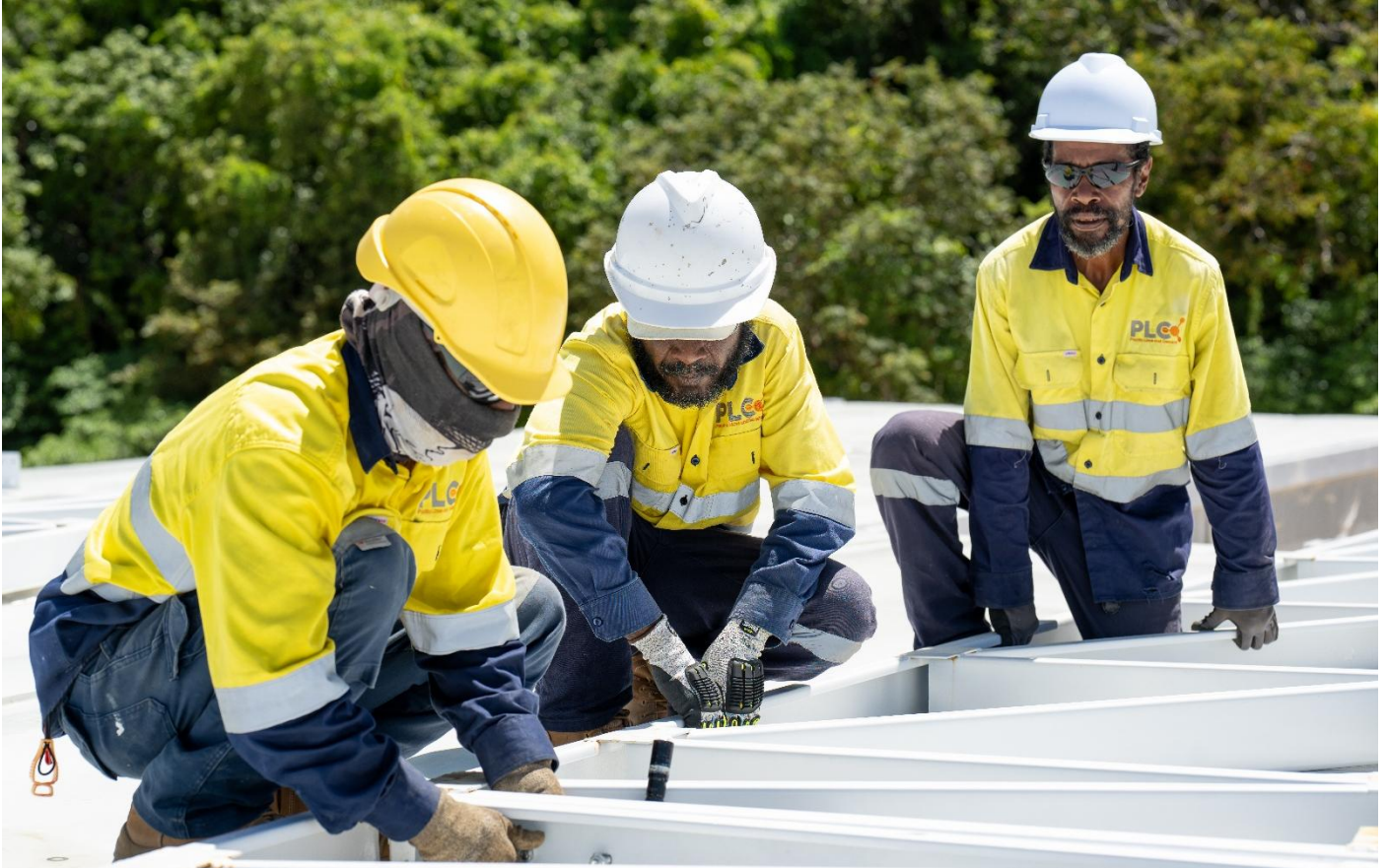
Image 9: Workforce numbers are increasing in line with construction progression.