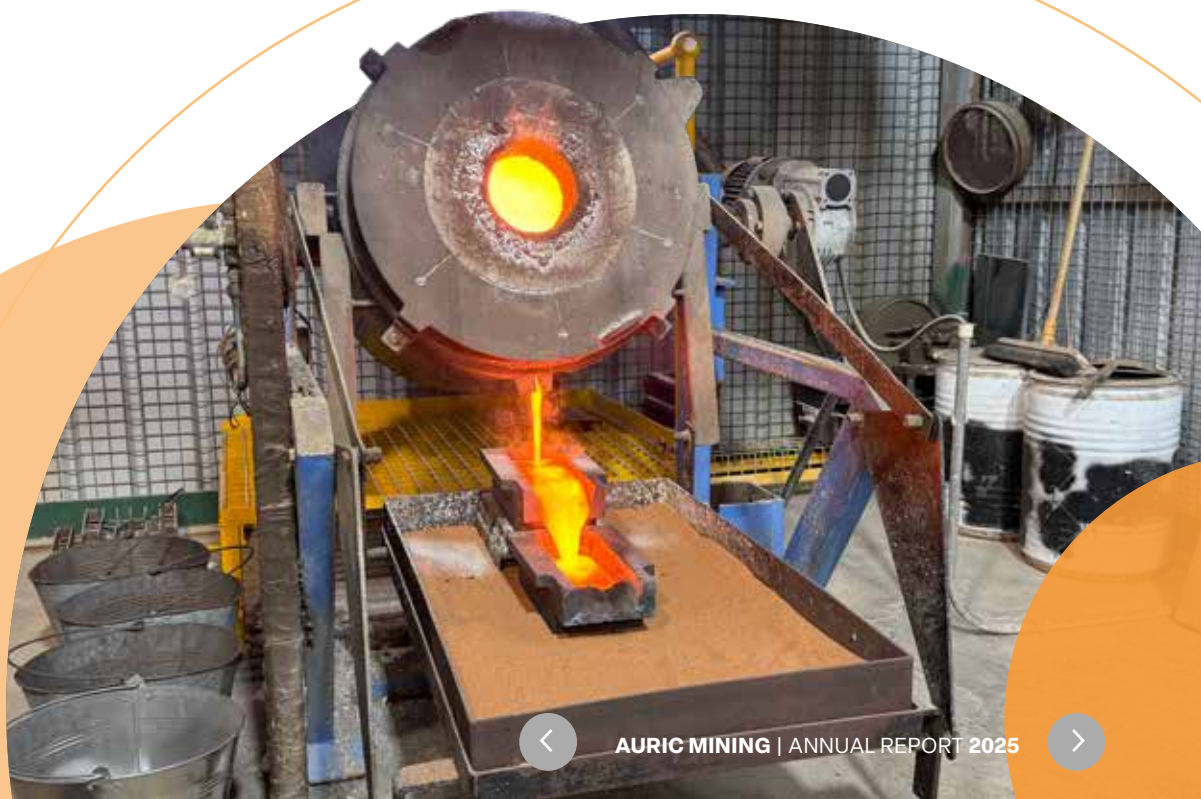
Figure 3. Munda gold pours at Lakewood Mill.

Processing of the first parcel of approximately 57,900 tonnes commenced on 12 October 2025 and was completed ahead of schedule on 2 November 2025. The first gold pour was achieved on 21 October 2025. Campaign One final reconciliation was completed on 18 November 2025.