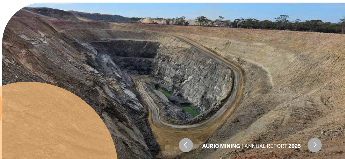
Figure 7. Jeffreys Find Gold Mine.

The project conclusively demonstrated the merit of Auric's joint venture model — a low-capital, zero-upfront-cost structure that allowed Auric shareholders to benefit from the economics of a successful open pit gold mine.