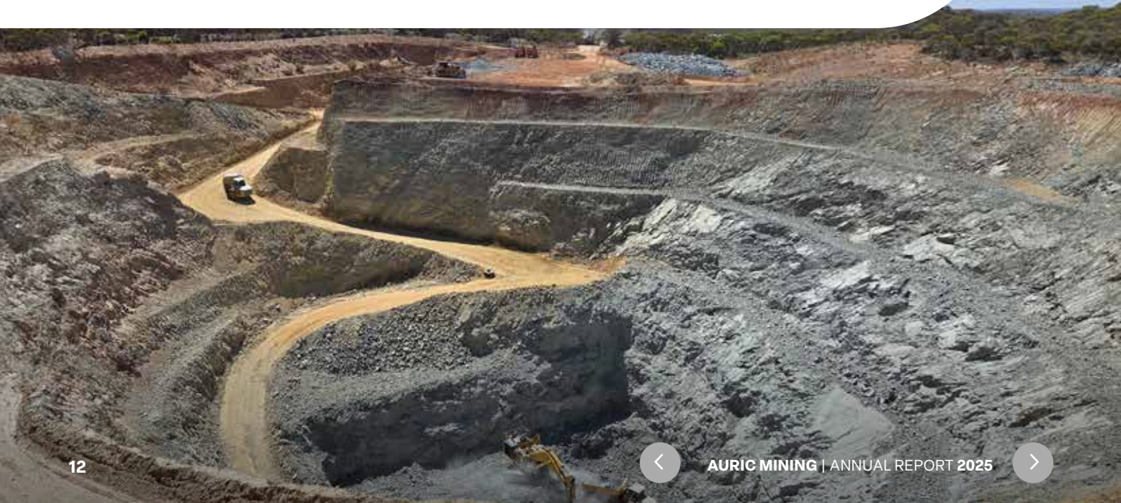
Figure 2. Munda Starter Pit.

Site preparation activities commenced in April 2025, including construction of a haul road, clearing for ROM pads and waste rock landform footprint, establishment of a site office and laydown area, and mobilisation of a mining fleet dry-hired from MHM Contracting Pty Ltd, the latter including a 125-tonne excavator and four 40-tonne articulated Moxi dump trucks.