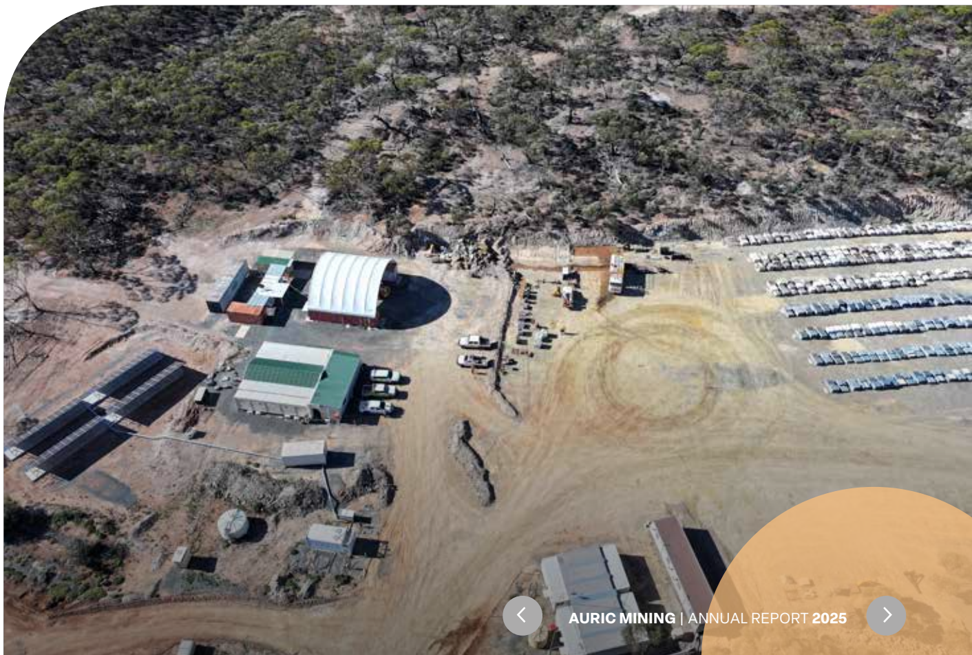
Figure 5. Munda camp site.

The Starter Pit delivered critical operational, geological, and metallurgical data that will directly inform planning for the larger Munda Main Pit. Reconciliation of grade control models with resource estimates, together with geotechnical and metallurgical learnings from Campaign One, will form the basis of an updated resource estimate and ultimately, pit optimisations and detailed mine design. Auric planned to commence this reconciliation and planning process in Q1 2026, with the objective of applying for a Main Pit mining permit later in the year. The Main Pit represents a significant opportunity to substantially increase gold output beyond Starter Pit levels and is expected to form the core of Auric's production profile for several years.