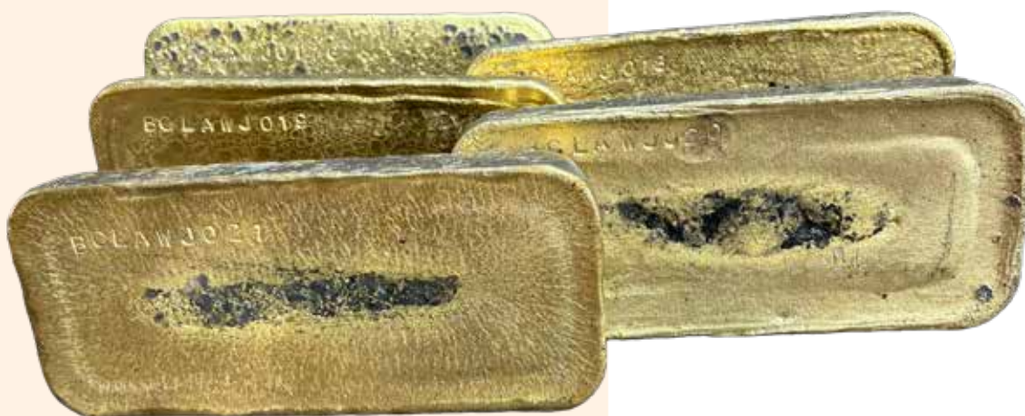
Figure 4. Munda gold doré bar.

An agreement for the second and final processing campaign for the Munda Starter Pit, comprising approximately 65,000 tonnes, was secured at Lakewood Mill with processing scheduled to commence in late January 2026. The Company expected Campaign Two to build on the momentum established in Campaign One, with receipts anticipated in early Q1 2026.