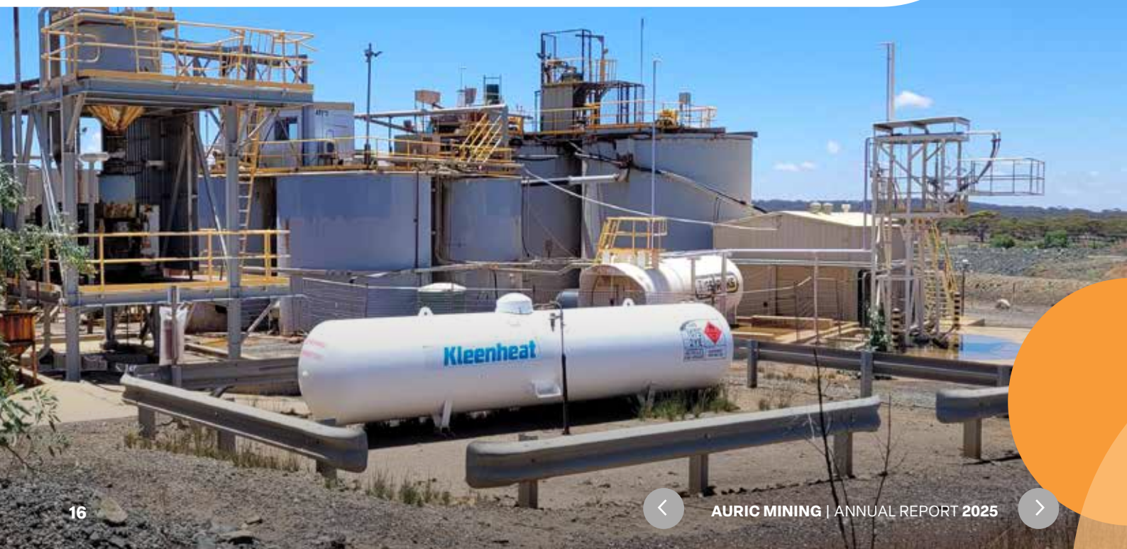
Figure 6. Burbanks Plant.

The acquisition price of $4.4 million represented a substantial discount to current replacement value, and the Board regards the Burbanks asset as one of the most strategically significant additions to Auric's portfolio since its founding.