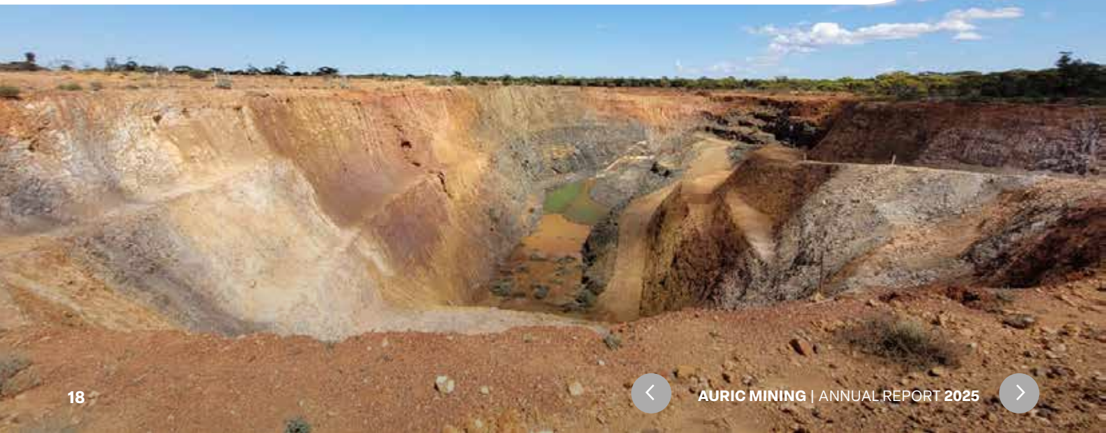
Figure 8. The Parrot Feathers Gold Deposit Northeast of Kalgoorlie.

The near-term potential for open-pit mining and toll treatment at Lindsay's is a key strategic rationale. Once fully acquired and permitted, the project would provide a second source of ore for toll milling and, ultimately, for processing through the Burbanks plant. New tenement applications in the area surrounding Lindsay's were lodged during the year to extend Auric's footprint.