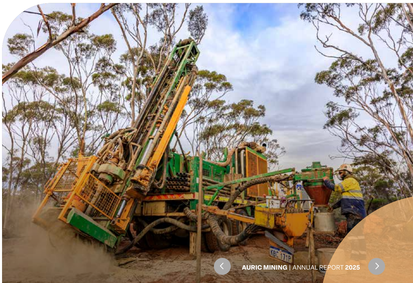
Figure 9. RC drilling at the Fugitive and Anomaly 37 Prospects.

As part of the nickel rights agreement with WIN Metals Limited completed in 2024, Auric consolidated full mineral rights across five additional Spargoville tenements where it had previously held only gold rights. This consolidation positions Auric to pursue all minerals within the project area.