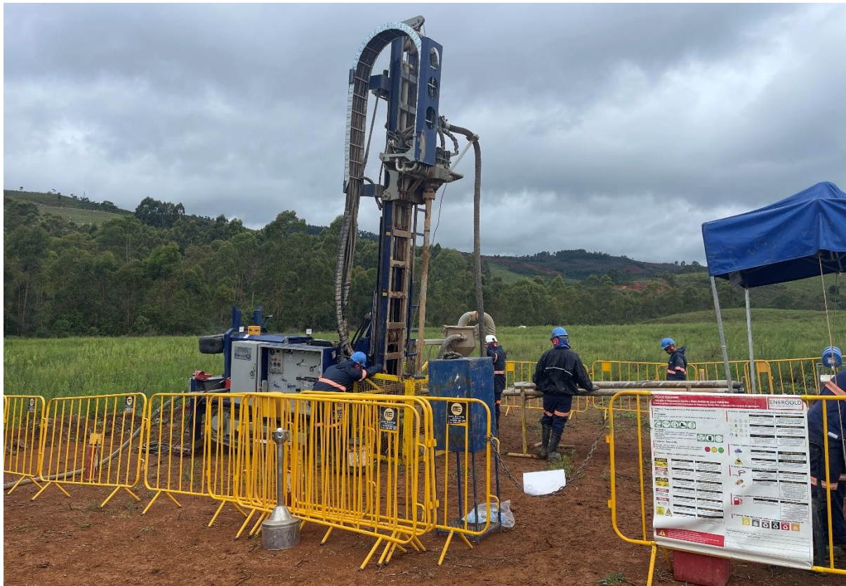
Figure 4: Viridis' drilling campaign during the March 2026 quarter.

An updated resource and reserve is targeted for Q2 2026.