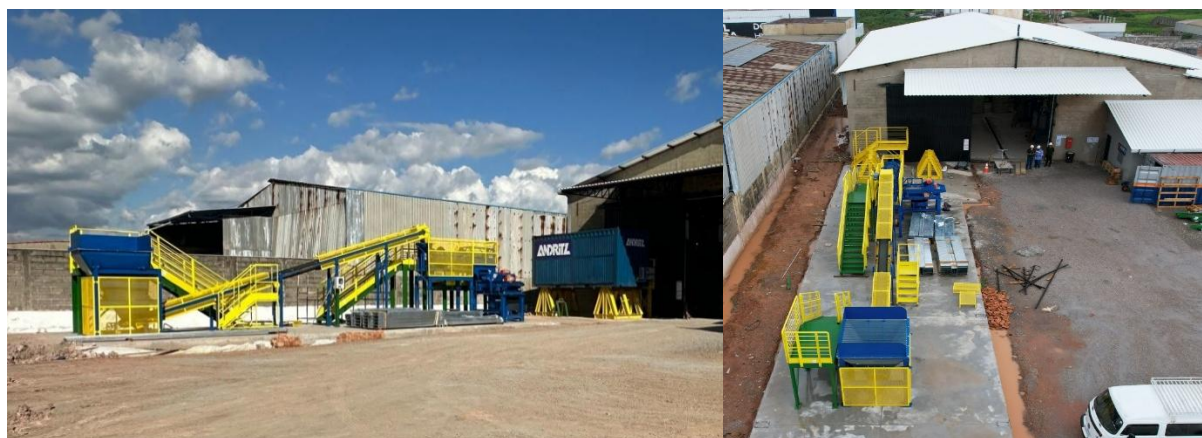
Figure 1: Ore scrubbing and handling package sized for 100kg/hr and Residue Ore Filter Press.

Viridis’ construction contractor is mobilised on site and progressing preparatory works including civil works, utilities installation, and pre-fabrication of piping and structural components. Viridis’ project management team completed construction and commissioning planning during the quarter, as well as developing all operations and laboratory procedures, and is ready to commence equipment integration and commissioning in early May when the environmental license approval is expected.