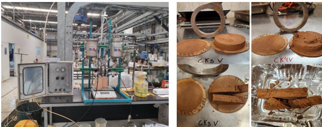
Figure 3: Filtration Testwork at Fremantle Metallurgy.