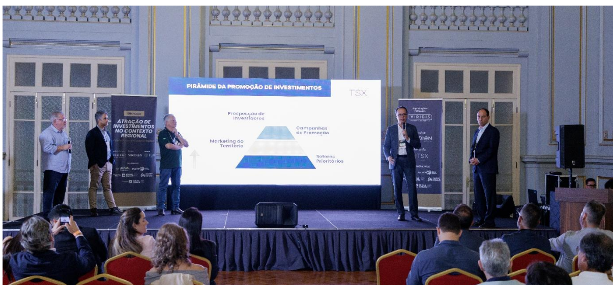
Figure 8: Investment Agency Forum.

The initiative was formally launched on 11 March 2026 during the SYNAPTIC Symposium in Poços de Caldas, attended by regional authorities, business leaders and institutional partners. The program will be implemented through a structured, multi-phase approach over an estimated 16-month period, with the agency headquartered at Argentina Mall. TSX Invest will provide technical support across core workstreams, including investment intelligence and facilitation, advocacy, innovation, and place promotion, under a governance model that includes community participation.