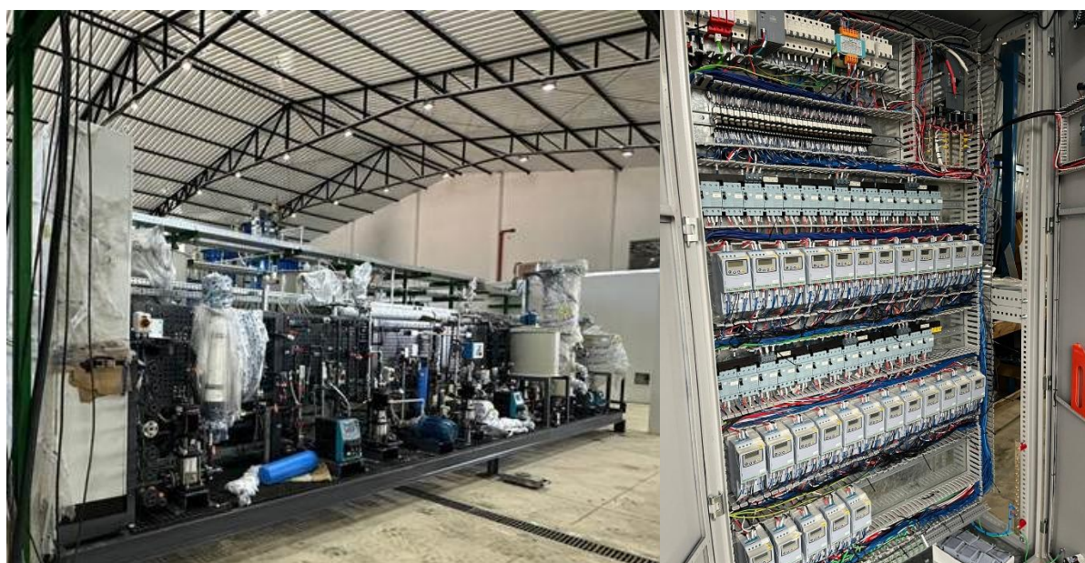
Figure 2: Water treatment and recycling skid delivered and stored at the CPTR on the left and fully integrated Programmable Logic Controller (‘PLC’) control system designed to control and provide data from the demonstration plant on right.