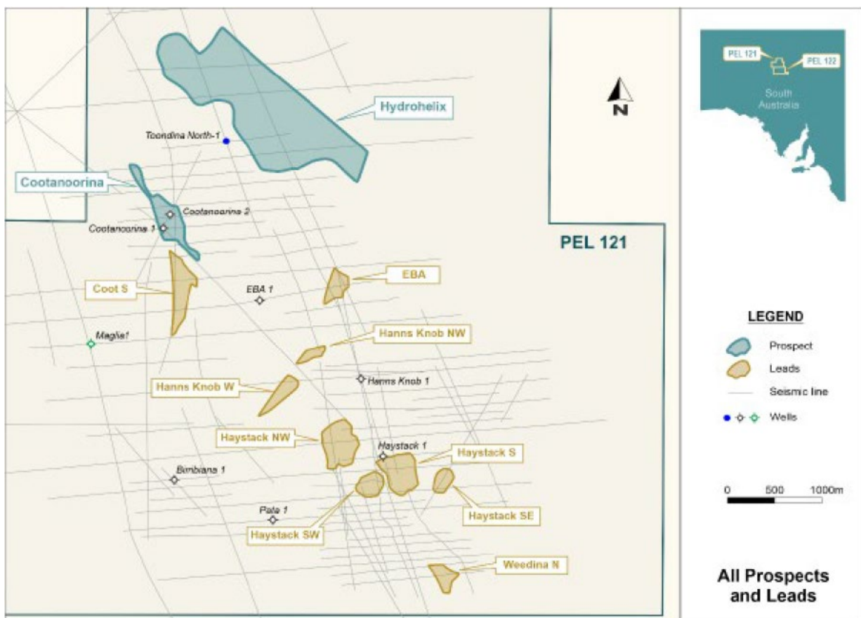
Diagram 2: Arckaringa Project Prospects and Leads

During the quarter, the Company continued to advance its Australian helium and hydrogen strategy in the Arckaringa Basin, with a focus on planning seismic acquisition and further technical evaluation across PEL 121 and PEL 122. Funds raised during the quarter will support seismic data acquisition aimed at refining drill targets across key prospects including Hydrohelix.