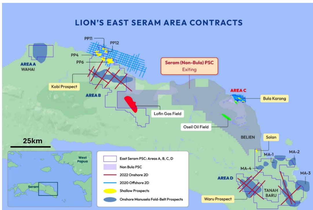
Figure 1: East Seram PSC with key prospects highlighted

The Bula Karang prospect represents a shallow carbonate reef target with a best estimate (P50) prospective resource of 12 mmbbl and an estimated geological chance of success of 38%. The well is targeting a broader carbonate and clastic play within the Bula Bay area, which offers additional follow-up potential in the event of exploration success. The Company continues to progress towards a targeted July 2026 spud date, subject to completion of remaining regulatory and contractual requirements.