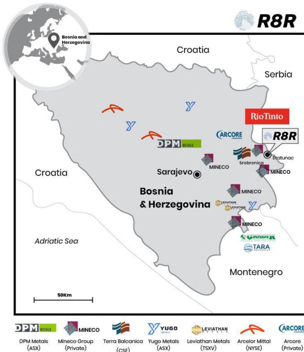
Figure 1: Bosnia and Herzegovina exploration and mining

Mineco currently operates three active mines in Bosnia and Herzegovina, including the Sase (Gross) and Olovo mines processing over 330ktpa producing high grade lead-zinc concentrates, providing strong validation of the jurisdiction’s operational stability and mining-friendly regulatory environment.