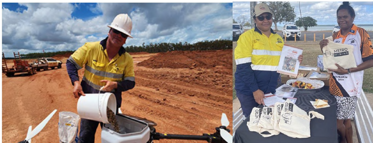
Picture: Drone being loaded with seed at BHM (L); seed picker sign up day Napranum (R)