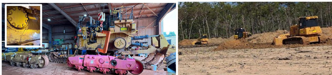
Picture: Replacement of a cracked track on a D10 dozer (L), D4 dozers stripping waste in March (R)

As of writing, BHM has received normal scheduled delivery of diesel fuel and aviation fuel. As planned, Ikamba took on bunkers in Singapore before return to site. Metro continues to work closely with all its suppliers in terms of fuel supply continuity.