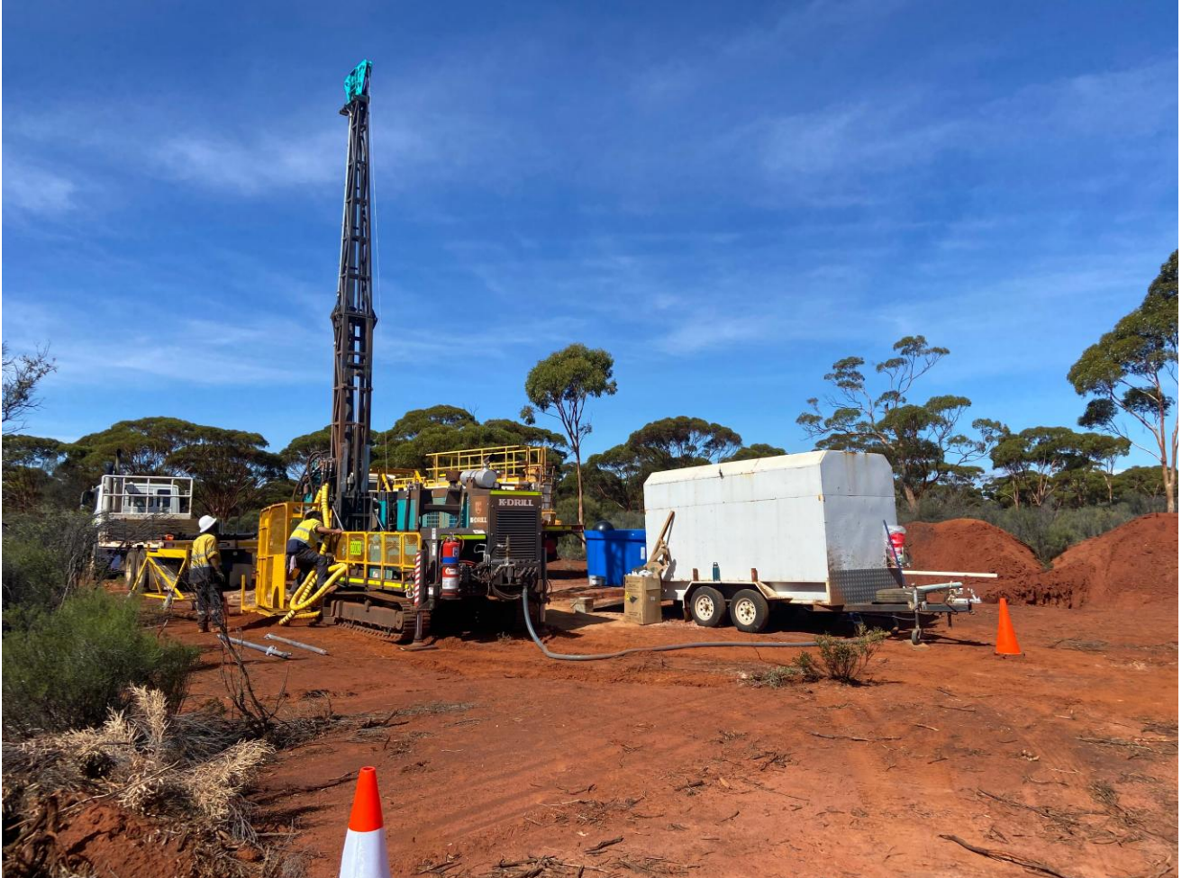
Figure 1: Diamond Drilling Rig drilling at the Kalgoorlie Gold Project

Samples collected from the drilling program will be used to undertake geotechnical laboratory testing, which will include Unconfined Compressive Strength (UCS) and Direct Shear tests. The results of this work will be used to formulate pit slope design to support the development of a stable and optimised pit design, and ongoing mine planning studies.