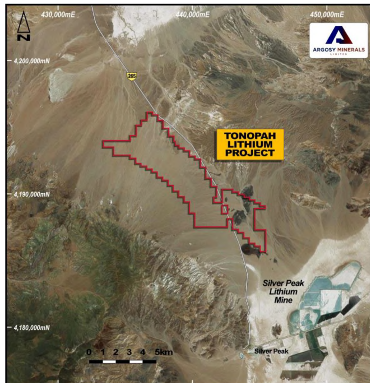
Argosy Minerals Limited – Tonopah Lithium Project Location Map

The Group has a 100% interest in the tenements comprising the Tonopah Lithium Project ('Tonopah'), located in Nevada, USA, which is strategically located near Albemarle's Silver Peak lithium carbonate operation in Nevada, USA.