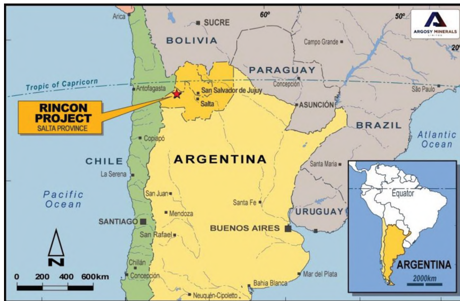
Argosy Minerals Limited – Rincon Lithium Project Location Map

The Rincon Lithium Project is the flagship asset in Argosy's lithium development strategy, and is located within the Salar del Rincon in Salta Province, Argentina, in the world renowned "lithium triangle". The Project comprises up to 8,606 hectares of mining concessions and mining easement right landholdings. The Company has established a well-defined pathway to target commercial production of LCE product.