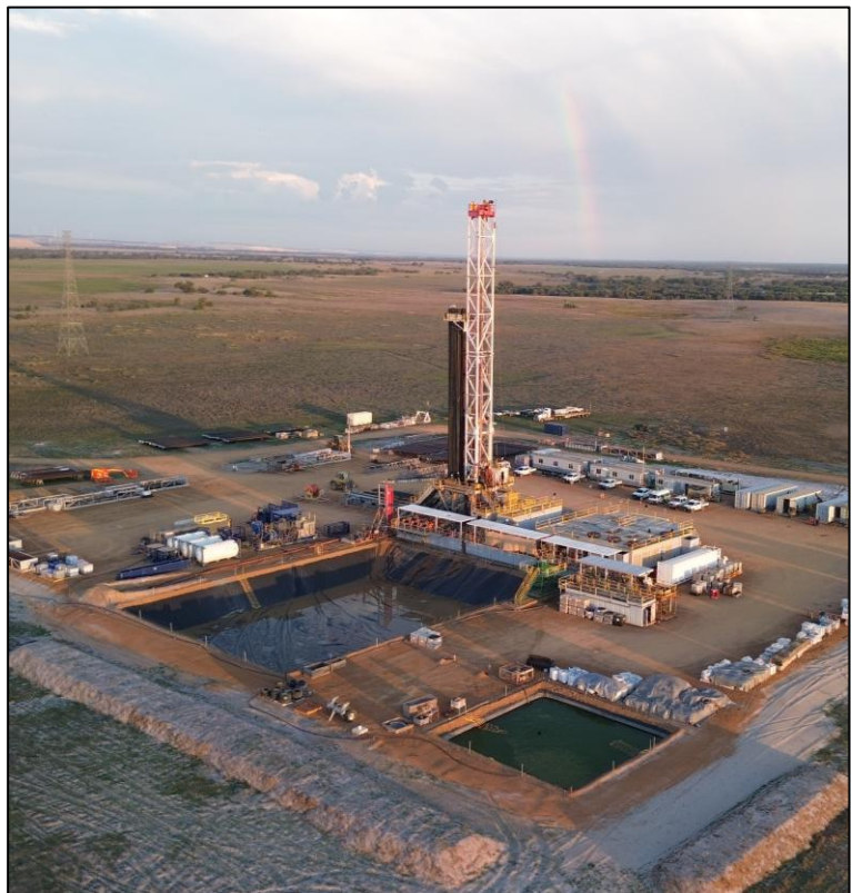
Ensign 970 Drilling Rig on location at Walyering West-1

Strike will update the market as material results become available.