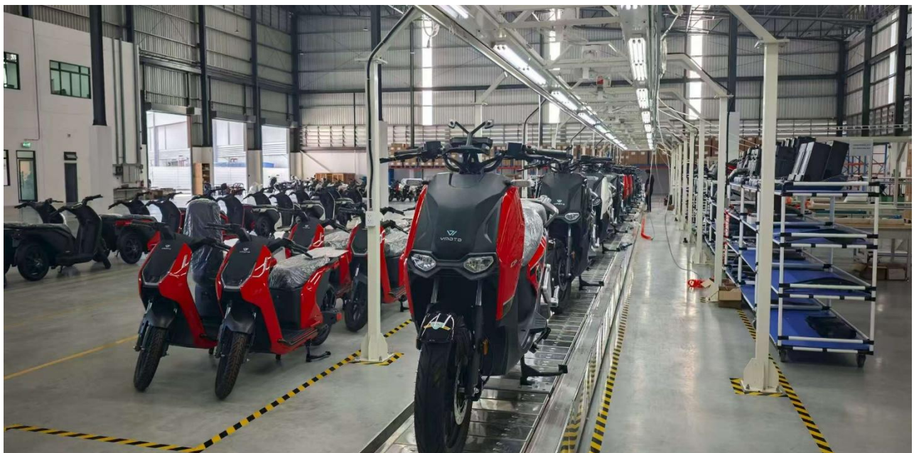
Photo: Vmoto's assembly facilities in Thailand

The Company also continued to fund operational costs and working capital for the set-up of Vmoto's assembly facilities and dedicated store in Thailand and the construction of Vmoto's new manufacturing facilities in Nanjing, China.