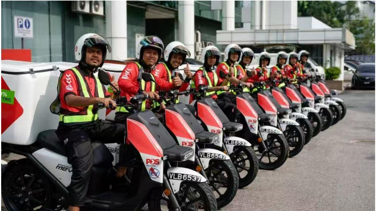
Photo: Vmoto's EV fleet products used by Malaysia Post for its delivery operations.

As at 31 March 2026, the Company has drawn down RMB 61 million (~A$12.9 million 1 ) in total from its unsecured and revolving bank operating facility provided by Industrial and Commercial Bank of China, Bank of China and Jiangsu Lishui Rural Commercial Bank in Lishui, Nanjing. The facility is being used to fund the working capital and construction of additional production capacity at a new premises located close to the Company's existing facility at an interest rate of 2.4%-2.7%.