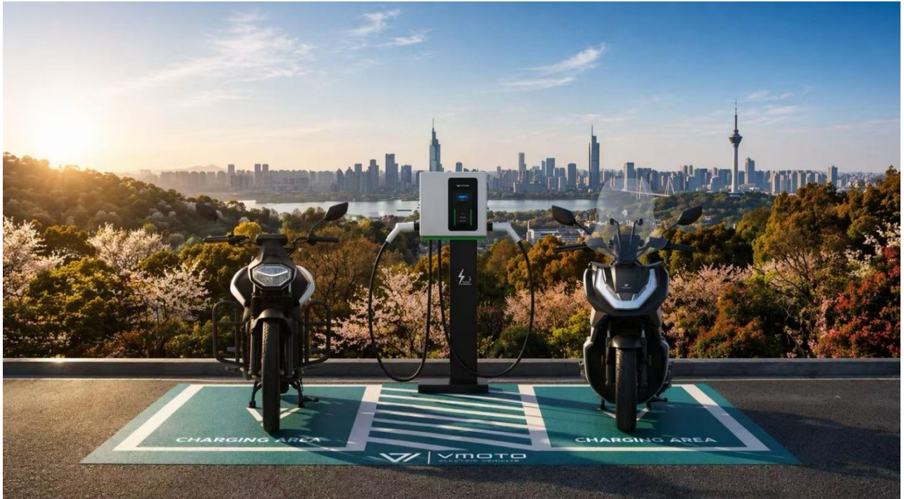
Photo: Illustrative photo of Vmoto's fast charging stations with Vmoto's EV products

The Company has supplied and commenced deploying its battery swapping station and fast charging station products with its invested companies and customers, including key markets, Brazil, Spain, United Kingdom, Saudi Arabia, South Africa and UAE. Vmoto expects to grow into more countries in the near future. These strategies and deployment will further enhance the value of the Company as an integrated e-mobility solutions provider as it will solve some of the distance anxiety of EV users, significantly shorten the downtime to recharge for delivery fleets and encourage the use of electric vehicles including Vmoto's products.