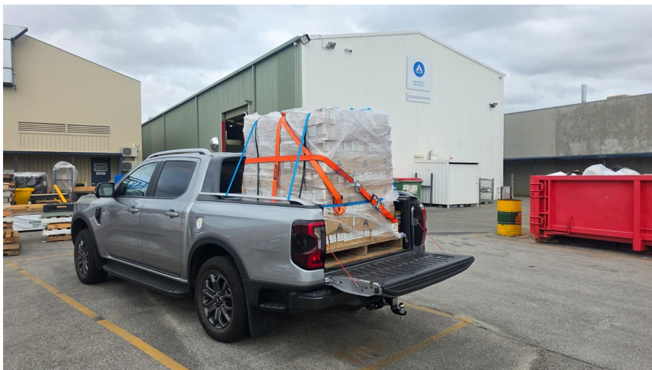
Figure 1 – Initial batch of ~3,300 priority samples mobilised for re-assay, forming part of a larger ~17,000 sample opportunity targeting resource growth and upgrade

This ASX announcement has been authorised for release by the Board of Mount Ridley Mines Ltd.