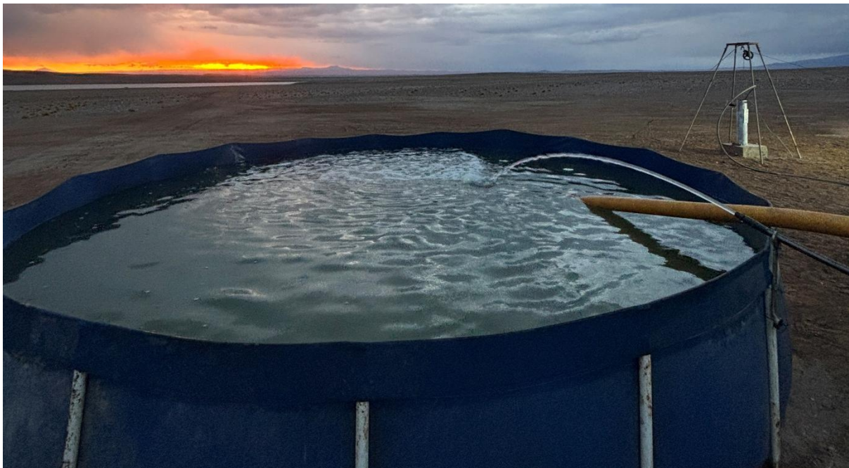
Figure 2. Well six 72 hour pump test produced more than 225,000L of brine containing lithium assaying as high as 412ppm.

The Company's concession covers 1,751 hectares (Has) or approx. 17.5 km 2 . Cilon covers 200 Has and operated in the past as a borate mine where ulexite was mined. Sealed road access is excellent and there is a large lagoon to the west in the concession. The 52 National sealed highway runs past the project and the town of Jama is 10km away and Susques is 104km away.