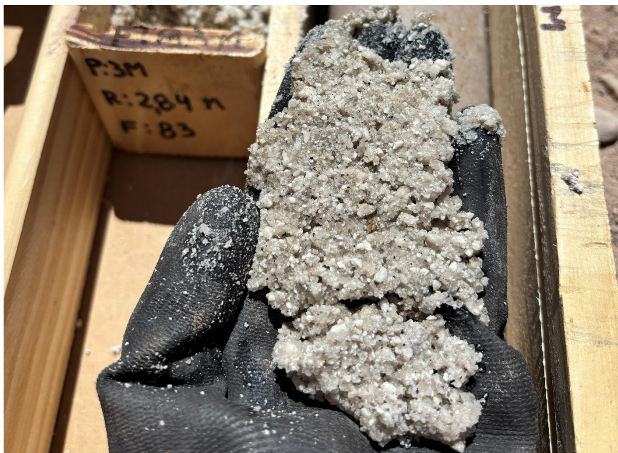
Figure 4. Core from (284m-287m): Unconsolidated, medium to coarse sand matrix, matrix-supported, with sub-angular clasts. Very high porosity from well six.

Well seven has been selected for low resistivity on MT Survey and on positive results expand the size of the aquifer by approximately 3km 2 with a drill hole in the far west corner of the project.