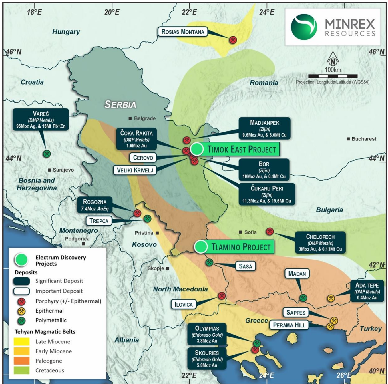
Figure 1 – Overview of Serbian Projects, showing Tethyan Magmatic Belts and Proximate Deposits

MinRex Resources Limited (ASX: MRR) is an Australian based ASX-listed gold and copper explorer with advanced exploration and development assets across Serbia and Australia. For further information regarding MinRex Resources Limited please visit the ASX platform (ASX:MRR) or MinRex's website www.minrex.com.au .