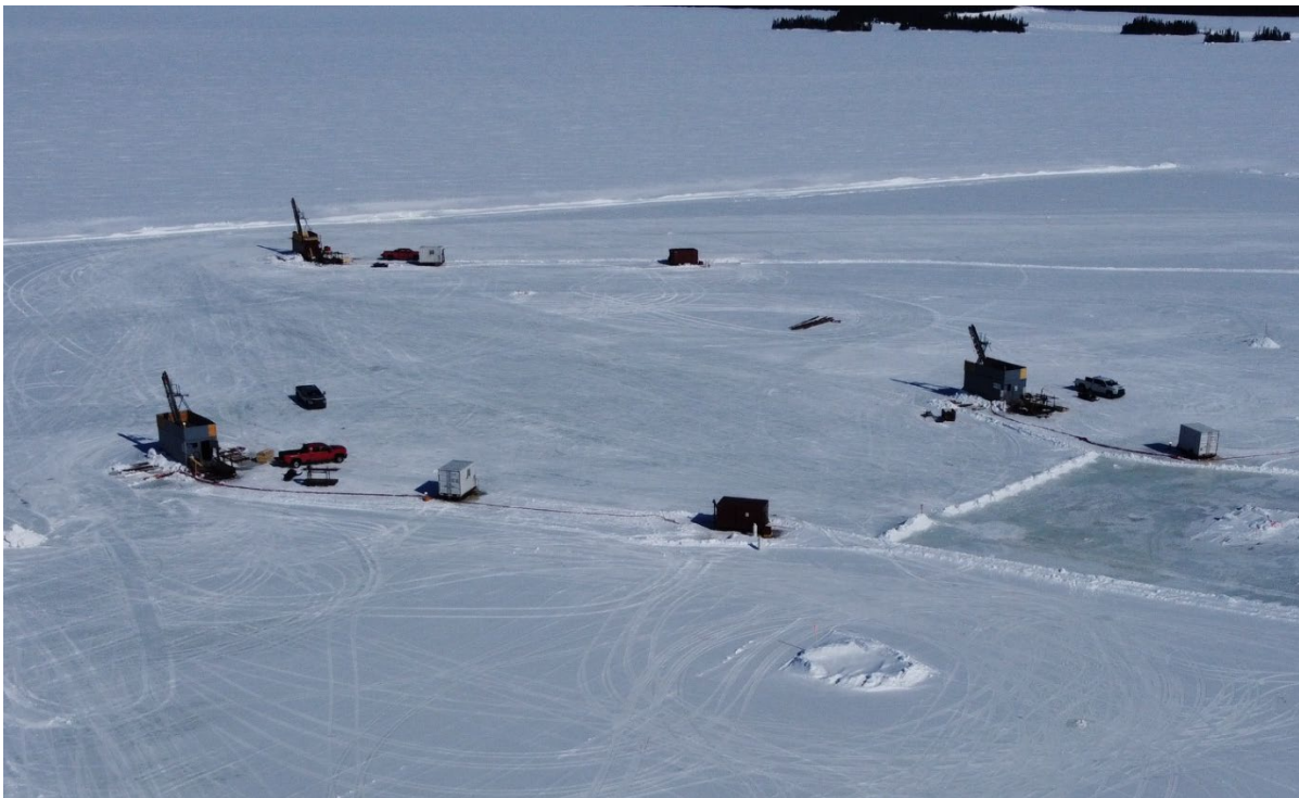
Figure 2: Three drill rigs completing the Golden Eye resource conversion program on the engineered ice pad (March 2026).