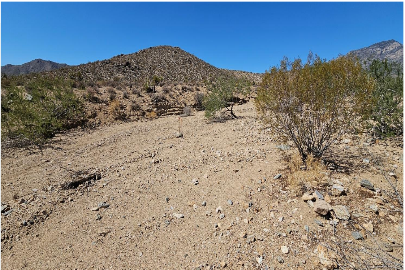
Figure 2: Desert Star – Drill Pad 1 Site Photo (P25-1)

The site visit also included a review of planned earthworks, drill pad preparation, water and fuel supply, sample handling procedures, and health, safety and environmental controls. Based on the outcomes of the inspection, the Company is satisfied that mobilisation planning is well progressing and that the maiden drilling program can proceed in line with the planned June mobilisation.