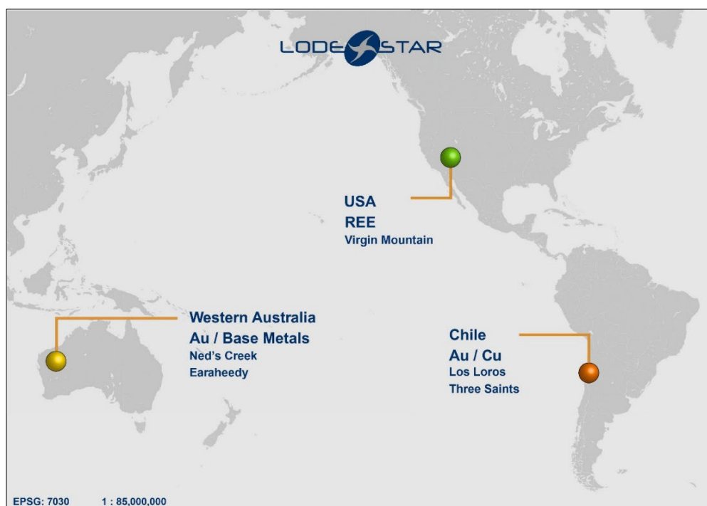
Figure 2: Global map of Lodestar Projects

Lodestar also has exposure to lithium via its 27.5M performance rights in ORE Resources (ASX:OR3) (previously known as Future Battery Minerals, ASX: FBM) who own the Coolgardie Lithium Projects.