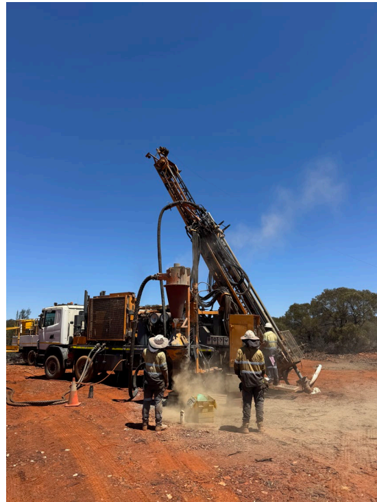
RC drilling rig in operation at the Goodenough Gold, East Menzies Gold Project, WA.