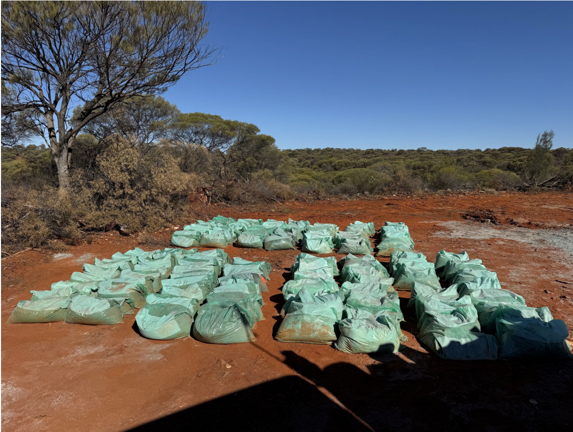
RC samples from drilling at the Goodenough.