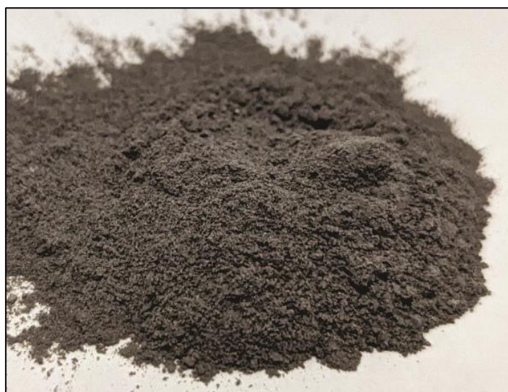
Figure 3: Antimony sulphide (37% Sb) precipitated from leach liquor 6

Antimony sulphide (with grade of 37% Sb) has been precipitated 5 (Figure 3) from this leach liquor demonstrating that the feasibility of a simple metallurgical process of leaching the copper-antimony-silver float concentrate, to selectively remove the antimony and then to precipitate it as a high-grade product.