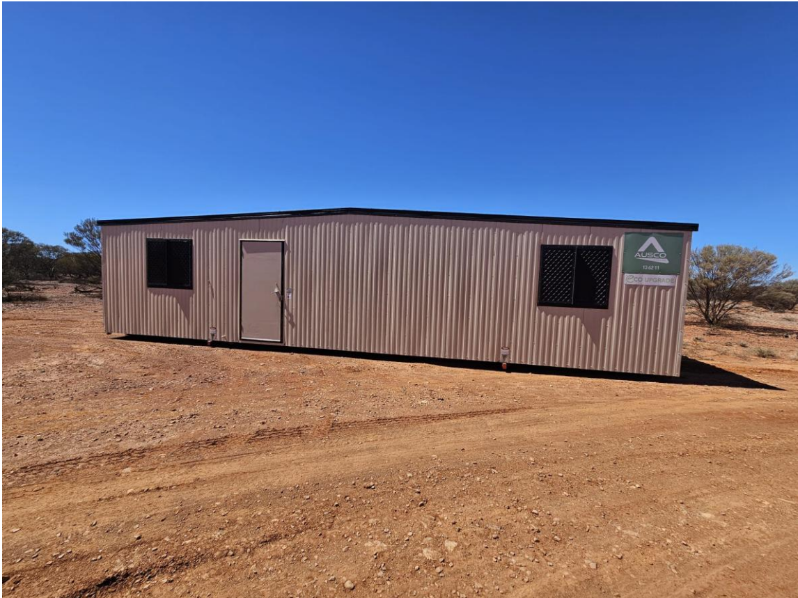
Figure 3: Early Stage Mobilisation of Site Offices to the Gold Duke Project.

In parallel with bore drilling, the Company has commenced with the delivery and installation of site offices. This early infrastructure will support the current production bore drill programme as well as clearing and grubbing and next phase of site establishment.