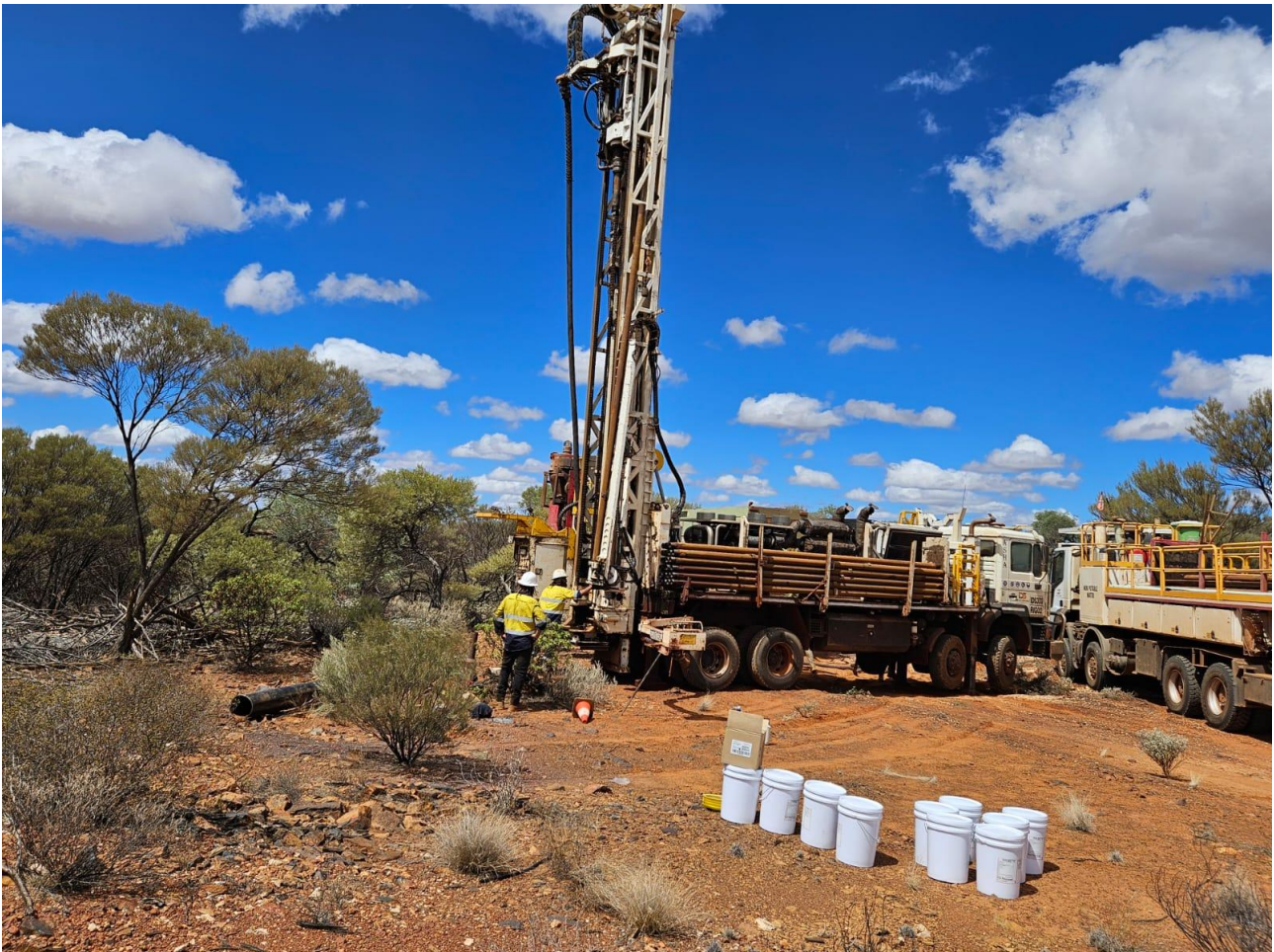
Figure 2: Drilling commenced at the Bowerbird Production Bore within the Gold Duke Project.

The groundwater extraction licence ( GWL213331(1) ) associated with this production bore has been approved by the Department of Water and Environmental Regulation ( DWER ), following the Company's previously announced Pre Mining Works Letter of Award, DWER Approval and Mine Operator Appointed 4 .