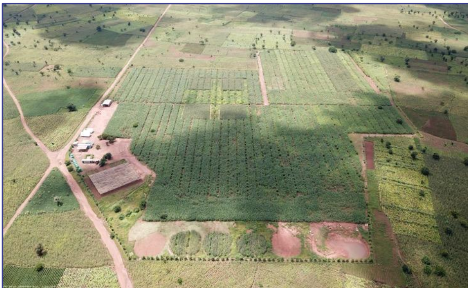
Figures 6-8: Images showing the progression of mining, backfilling and rehabilitation at Sovereign's Rehabilitation Trail Site.