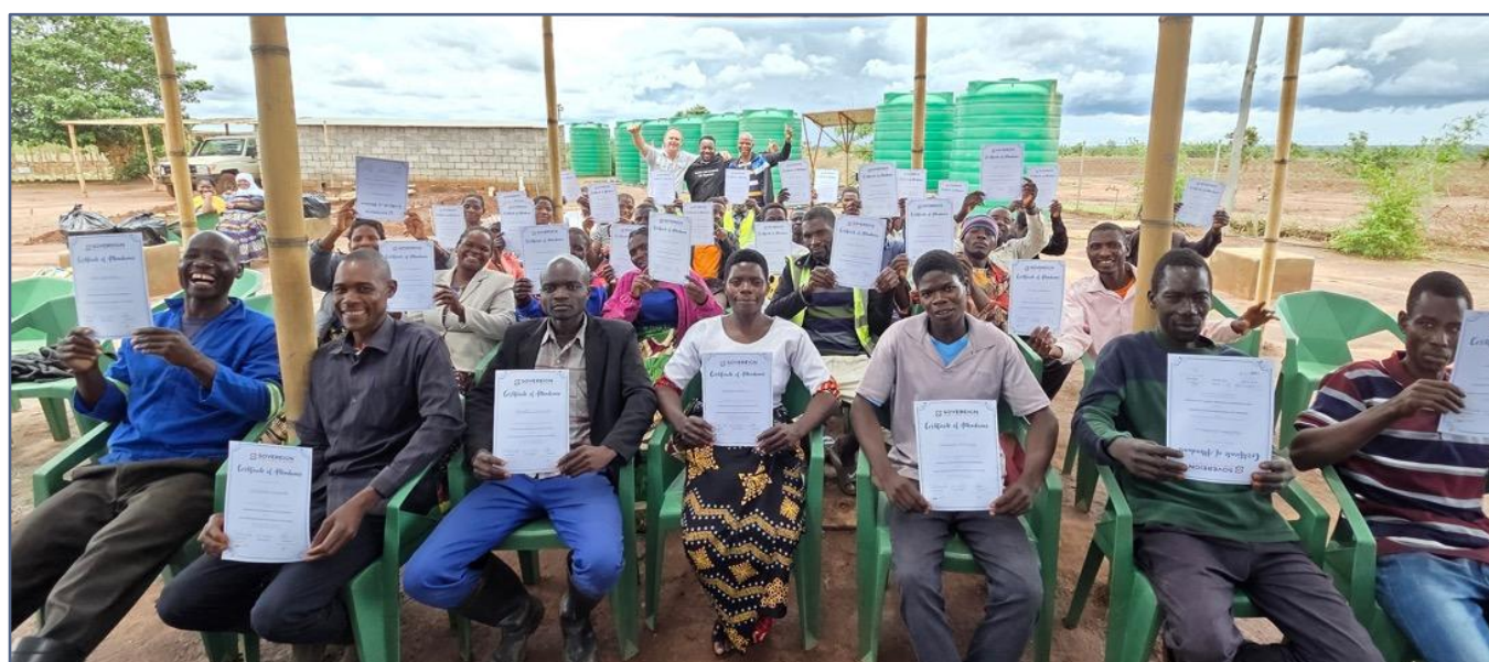
Figure 5: Rehabilitation site farmers with agreements on setting up a farming co-operative.

Sovereign has worked closely with local farmers over the past two years, who have been integral to the success of the rehabilitation program. This deepening partnership has resulted in participating farmers formally requesting that Sovereign remains involved at the trial site and provide support in establishing a farming co-operative – a strong endorsement of the program's value to the local communities. The development of community-led farming co-operatives forms a central pillar of Sovereign's post-closure social transition strategy. The Company plans to continue working with local farmers throughout 2026, with a view to establishing a replicable model that can be scaled across the broader Kasiya project area as mining progresses.