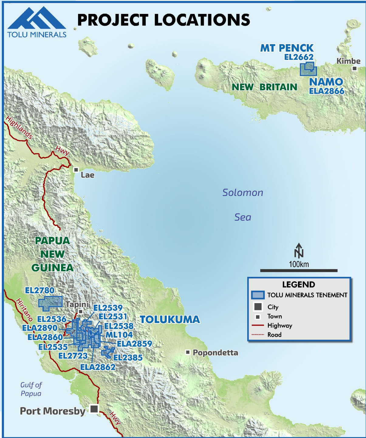
Figure 1: Tolu Project Locations