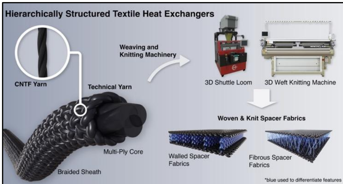
Figure 1: Hierarchically Structured recyclable Textile Heat Exchanges and 3D Knit equipment.