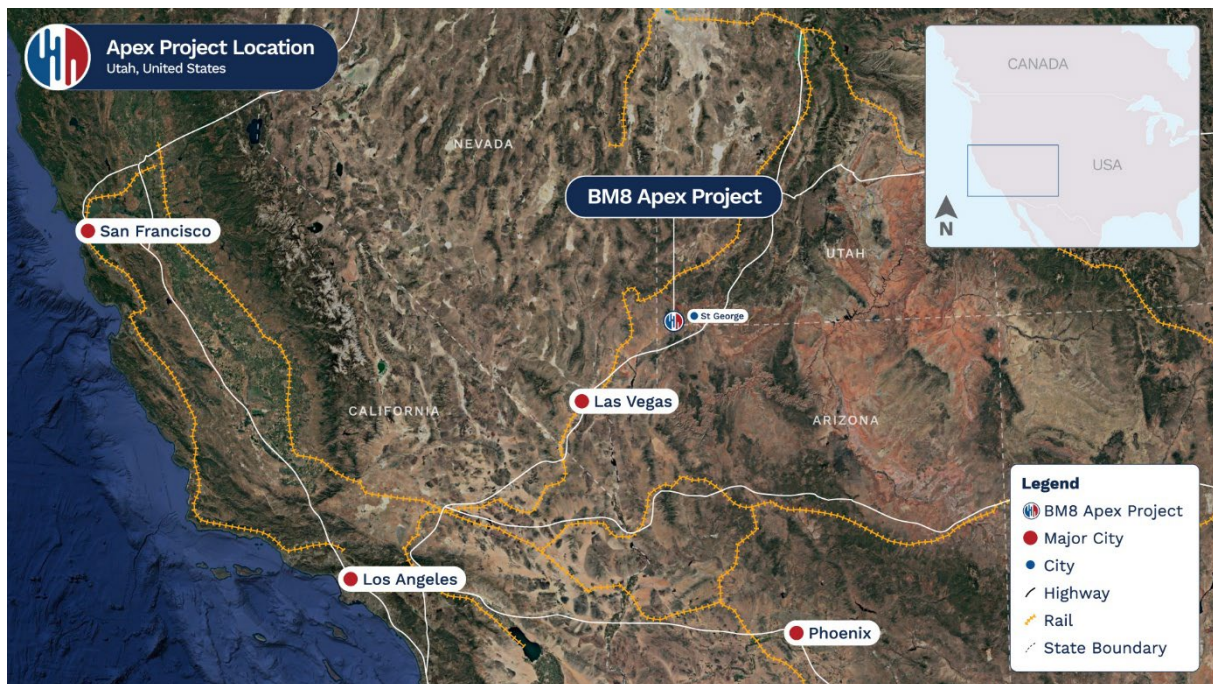
Figure 2: Apex project, located in south-west Utah, USA

To advance target definition ahead of fieldwork, the Company is integrating high-resolution WorldView-3 satellite imagery into its geological assessment.